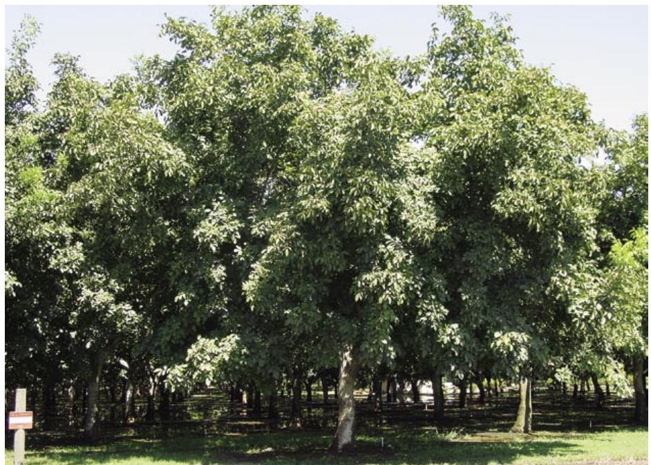
Careful rootstock selection can help to prevent blackline infection. Above, healthy walnut trees on English rootstock (variety 'Chandler') in an orchard near Linden.