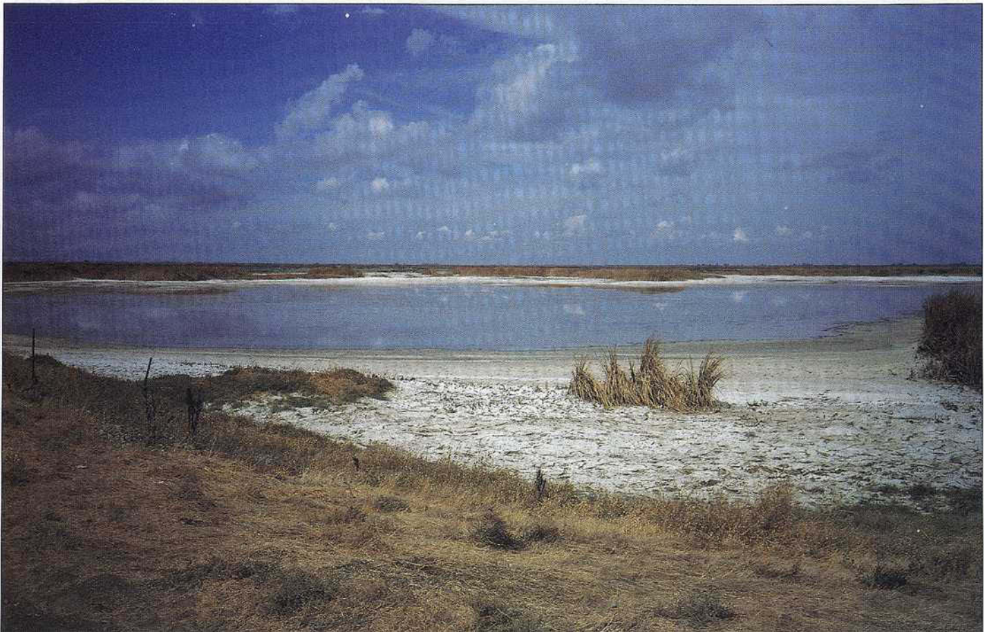
Former holding area for westside drainwater.