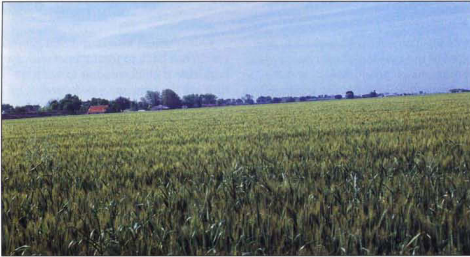
Proper timing of herbicide application to this Delta wheat field resulted in excellent grain heads and high yield.