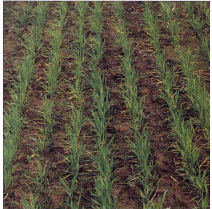
At the 2-3 leaf stage, wheat is at the most susceptible stage for 2,4-D damage.