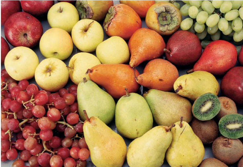
An innovative approach will be needed if the 2007 Farm Bill is to promote the growth and consumption of healthy fruits and vegetables, staples of California agriculture.

part because of farm subsidies. What we don't want to see in the next Farm Bill are California farmers wanting those same kinds of subsidies. I would like to see government