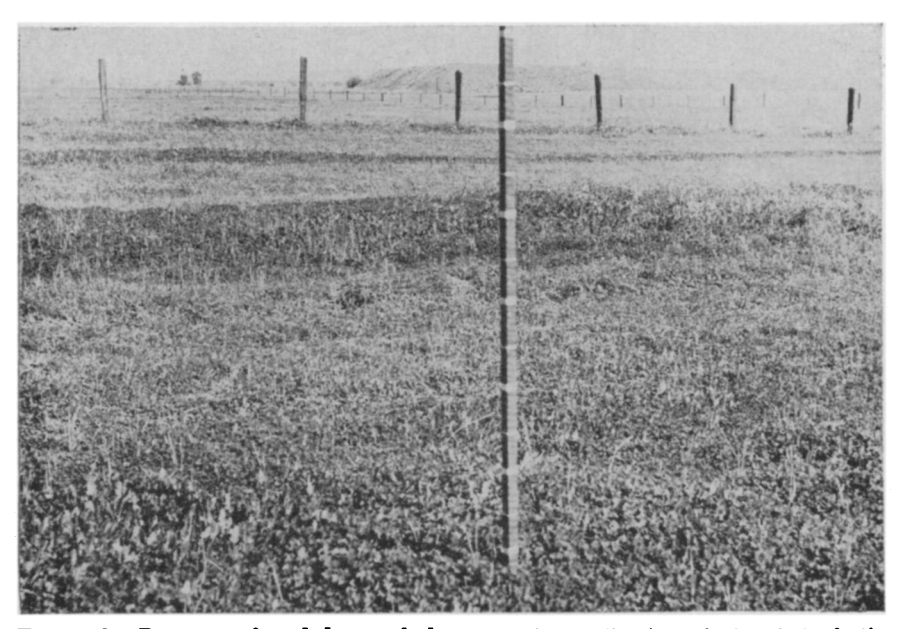
FIGURE 2. Response of seeded annual clovers to the application of phosphate fertilizer (dark strips). Photo was taken March 30, 1953 in field 3 after 40 days without rain.

field 2 was subjected to a short period of heavy grazing by 60 cows from March 10 to April 17.