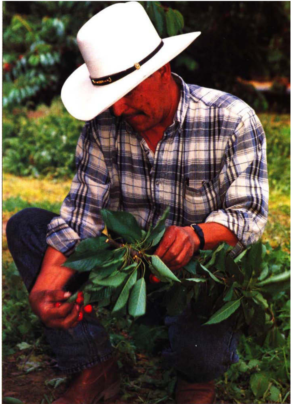
When identifying the most challenging and rewarding aspects of their positions, farm supervisors overwhelmingly selected their relations with people.

Those in upper management were six times more likely to fire an employee (85%) than first-line supervisors (14%). Respondents recalled having fired the last person as long as 44 years ago and as recently as 2 weeks ago, with an average of a little over 10 years since the last termination. Considering that the average time working as a supervisor was 14 years, it is clear that farm employees are not often terminated. In several instances the distinction between the employees being fired or quitting was blurred, as was the distinction between being fired or simply not rehired the next season. With the exception of two instances,