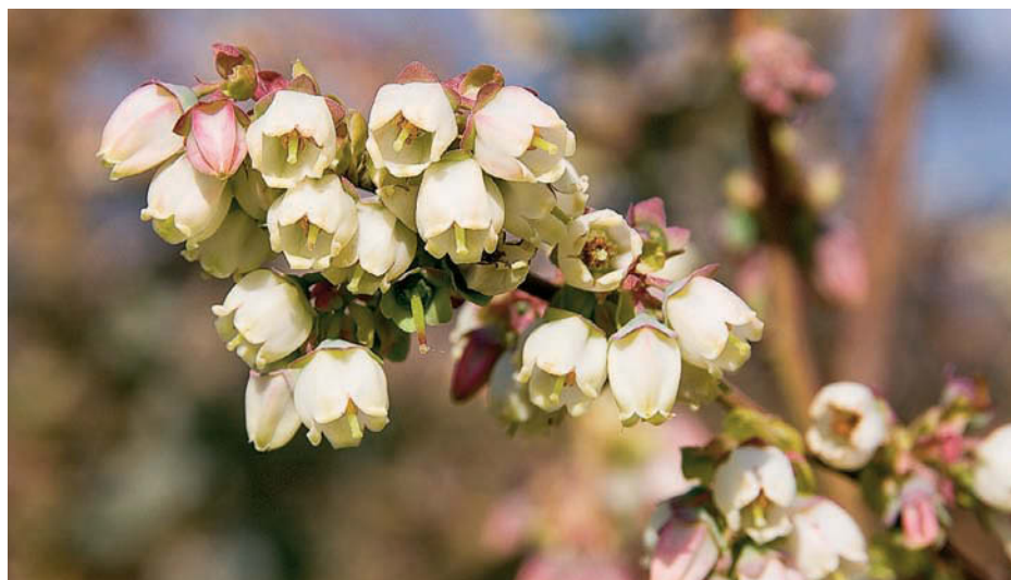
Jack Kelly Clark

Trial I. We initiated blueberry observation trials at the UC Kearney Agricultural Research and Extension Center (KREC) in Parlier in 1997, which have provided insight to key characteristics of numerous blueberry cultivars. The results of these trials indicated that southern highbush blueberry cultivars