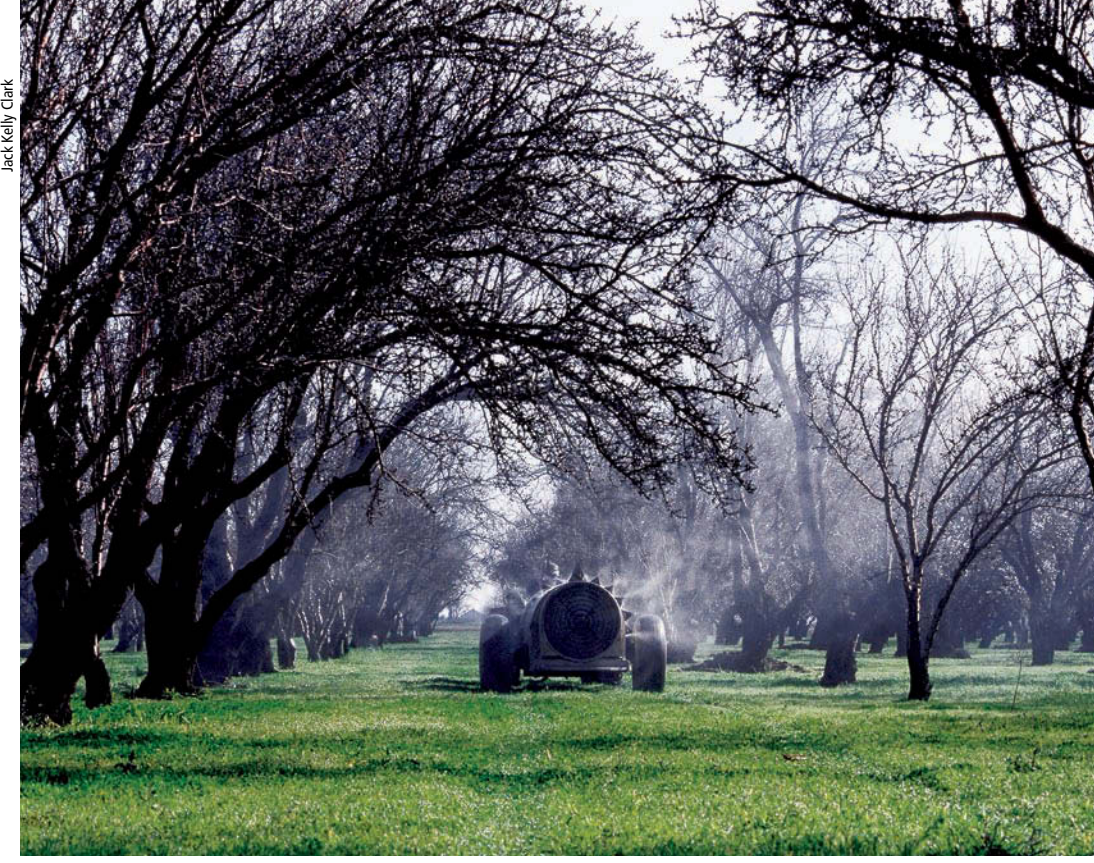
Air blast sprayers are used for ground applications of pesticides in orchards. Almond growers reported applying dormant season, May and hullsplit insecticide sprays less frequently in the current survey than in a 1985 study.

A completion rate of 39% resulted in a final response set of 453 growers (table 1). Three hundred and twenty-