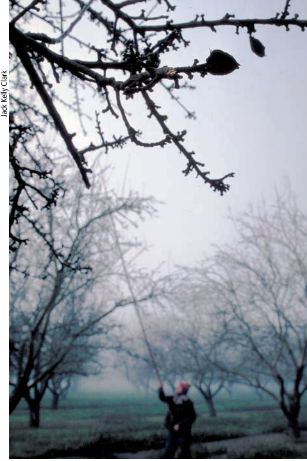
Winter mummy-nut removal is critical to managing navel orangeworm. Growers with independent (non-supplier-affiliated) PCAs were more likely to perform winter-sanitation measures such as poling (shown), which helps to prevent overwintering of the pest's larvae.

Pesticide use. In debates about the significance of PCA affiliation, an issue that is often raised is whether supplier-affiliated PCAs promote more chemical use. It is often assumed that independent PCAs are more likely than supplier-affiliated PCAs to rec-