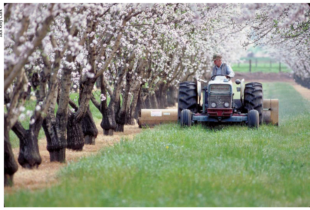
Strip weed control is used by many almond growers to manage orchard floors. Among the benefits of this approach is reduced pesticide runoff.

Statistical tests show that growers with smaller acreage were less likely to use independent PCAs than those with larger acreage. Growers with supplieraffiliated PCAs managed a mean of 233 almond-bearing acres, while those who primarily used independent PCAs managed a mean of 307 almond-bearing acres (Wilcoxon 2-sample, P < 0.001). This difference may be due to the economies of scale afforded to PCAs by larger orchards. The practice of compensating independent PCAs on a per-acre basis provides a disincentive for the PCAs to accept contracts on small farms, where the compensation is smaller relative to fixed costs associated with traveling to and from the orchard regularly.