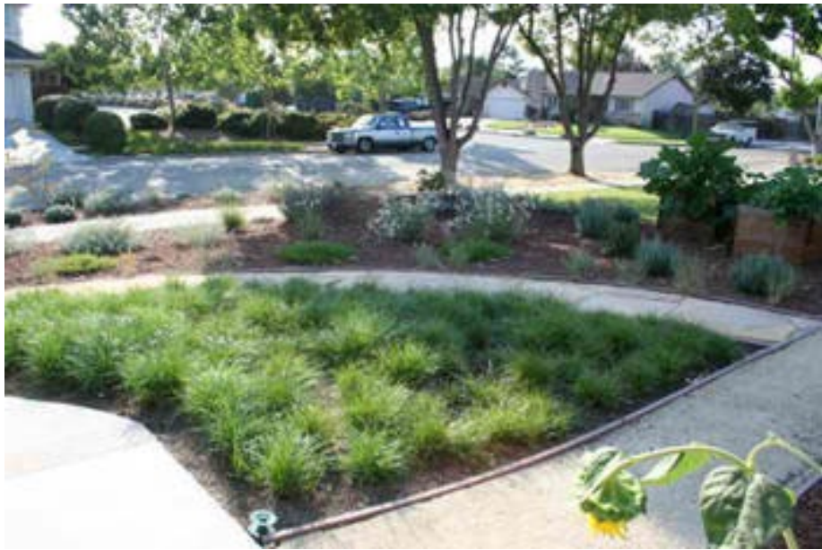
Carex pansa (California Meadow Sedge) * CA Native *