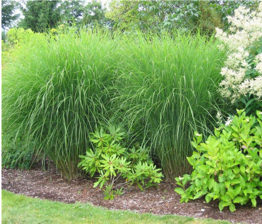
Miscanthus sinensis 'Gracillimus'