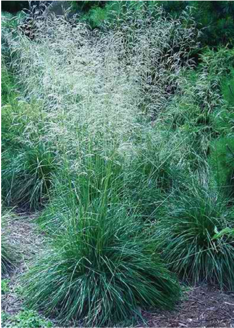
Deschampsia cespitosa (Hair Grass)