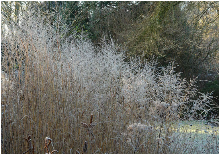
Panicum virgatum 'Heavy Metal'