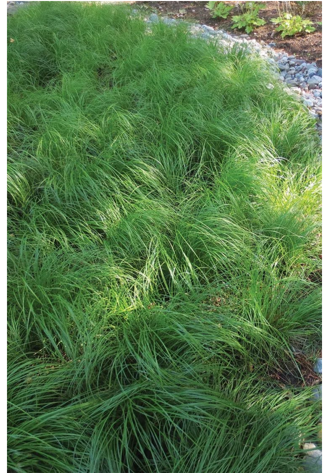
Carex pennsylvanica (Pennsylvania Sedge)