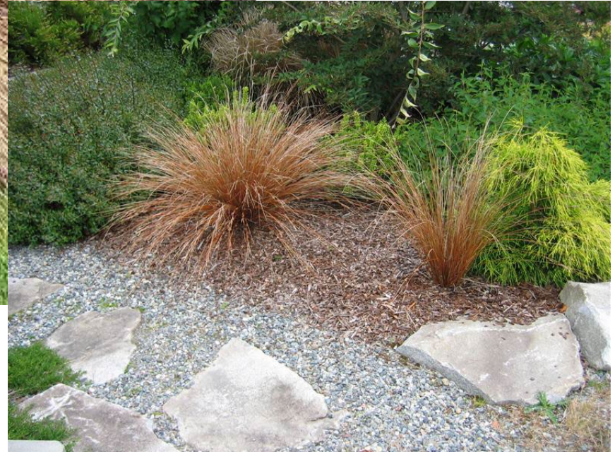
Carex buchananii (Leatherleaf Sedge)