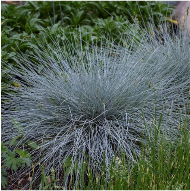
Festuca glauca (Common Blue Fescue)