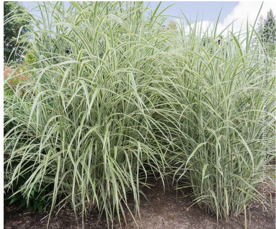
Miscanthus sinensis var. condensatus 'Cosmopolitan'