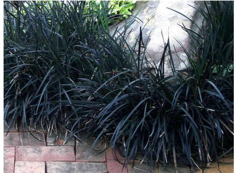
Ophiopogon planiscapus 'Nigrescens' (Black Mondo Grass)