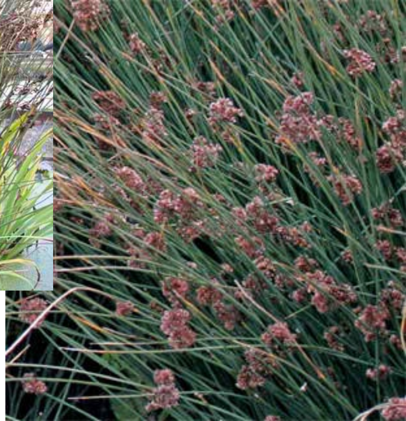
Juncus patens (California Gray Rush) * CA Native *