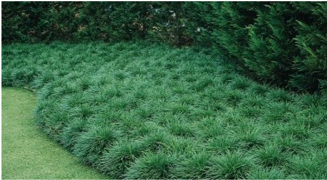
Ophiopogon japonica (Mondo Grass)