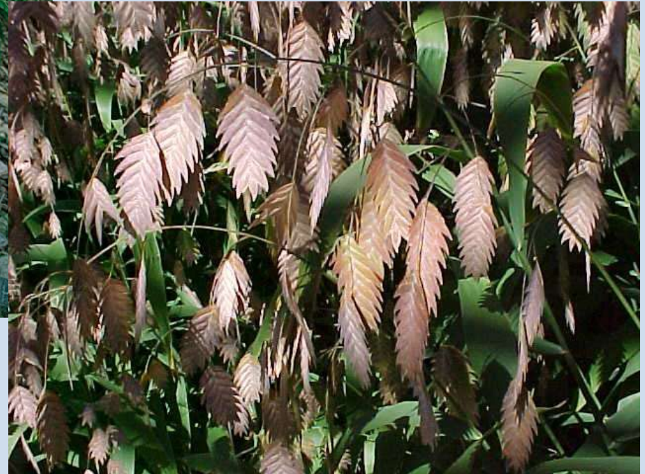
Chasmanthium latifolium (Sea Oats)