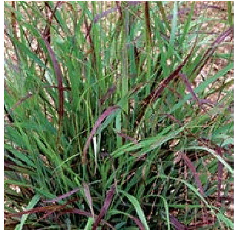
Panicum virgatum 'Shenandoah' (Switch Grass)