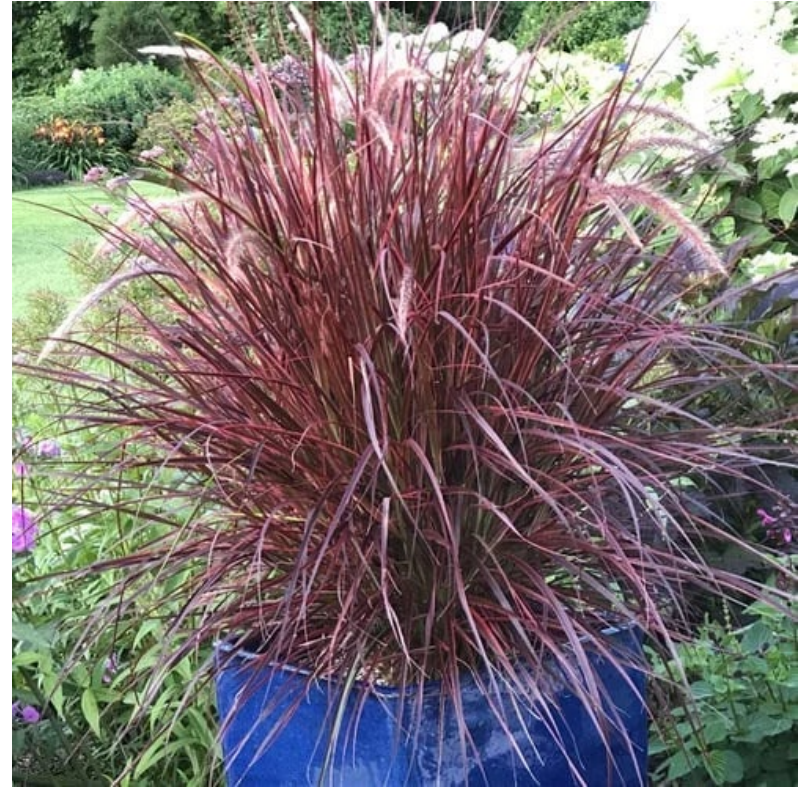
Red Fountain Grass