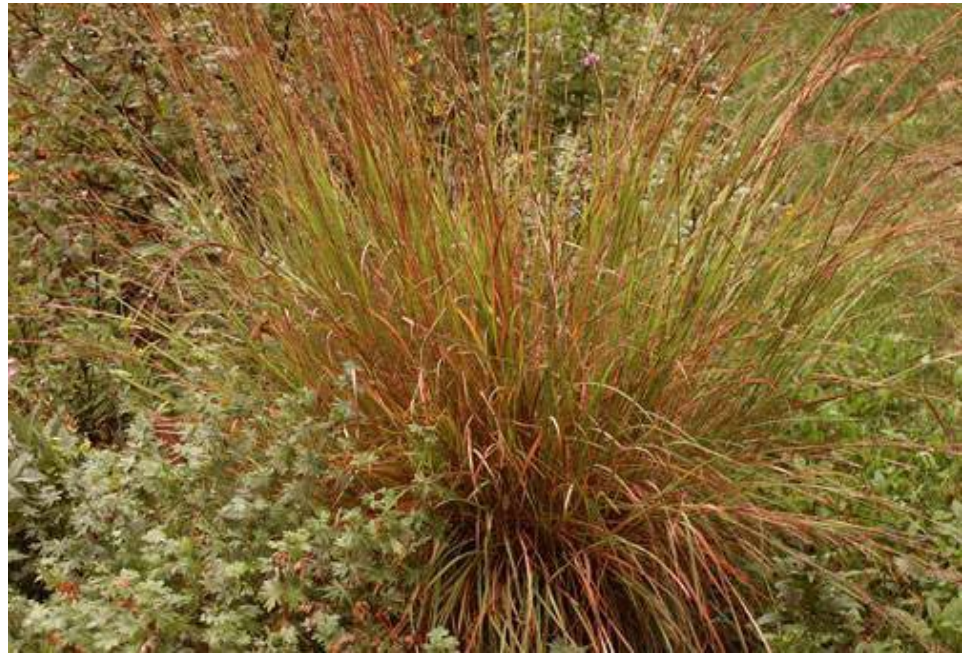
Schizachyrium scoparium (Little Bluestem)