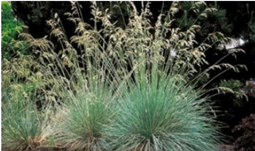
Helictotrichon sempervirens (Blue Oat Grass)