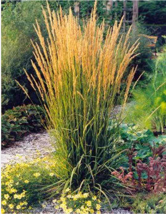
Calamagrostis x acutiflora 'Karl Foerster'