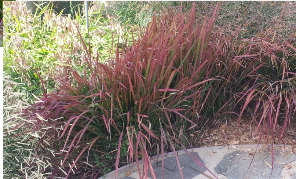
Imperata cylindrica 'Rubra' (Japanese Blood Grass)