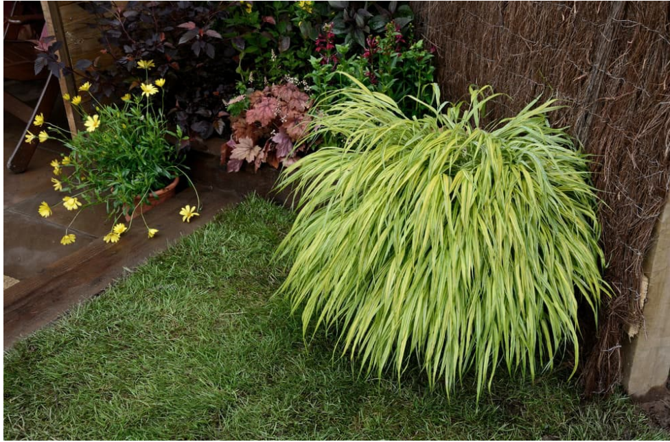
Japanese Forest Grass