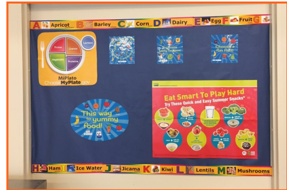
SLM Kit Posters