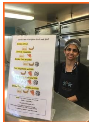
Clear Flyer Board