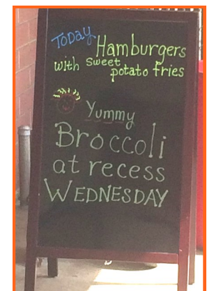
Chalk Sandwich Board