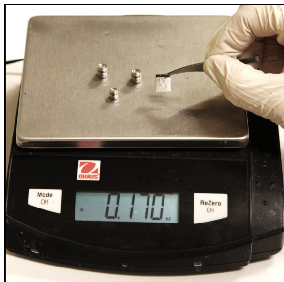
Testing the accuracy of weighing devices.