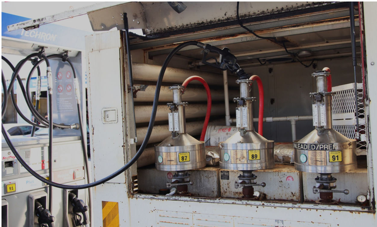
Testing a Retail Motor Fuel Dispenser (RMF).

The San Francisco Sealer of Weights and Measures is responsible for the inspection, testing and certification of all commercial scales and meters within the City and County of San Francisco. In 2011 staff inspected 4024 devices in the city/county to insure accuracy of measurement within State of California tolerances. These devices were inspected at 2210 locations throughout the City/County. There were 2271 scales and 1753 meters inspected at wholesale and retail locations.