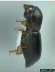
Red Bay Ambrosia Beetle

As of 3/8/2010, the red bay ambrosia beetle has been found in Miami-Dade County.