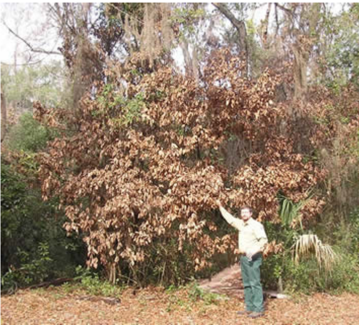
Laurel Wilt Disease