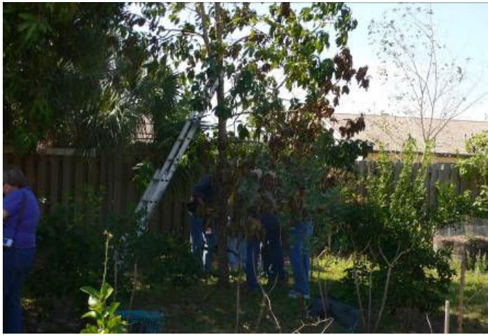
Avocado in process of collapse. In this case, single branches are dying.