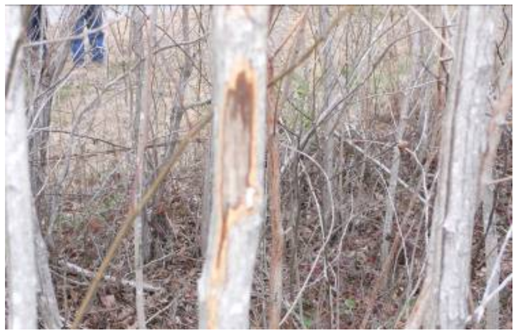
Sassafras (Sassafras albidum) in collapse.