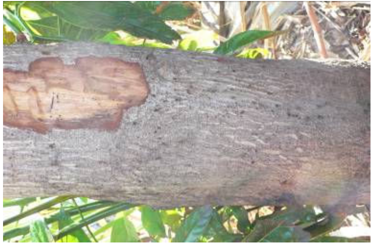
Vascular staining in avocado with beetle entry holes.