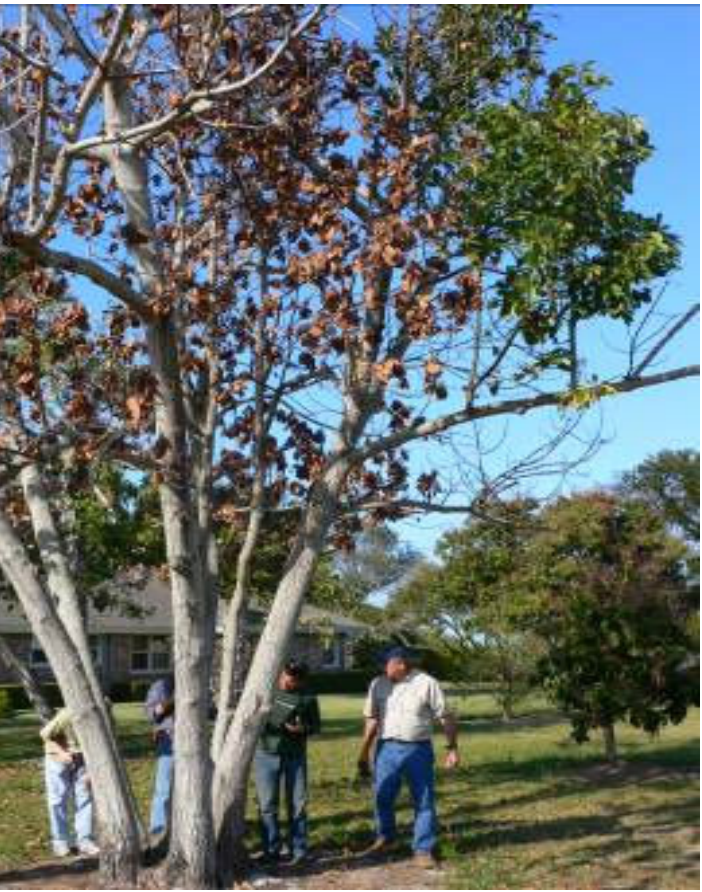
Multi-trunked avocado in process of collapse.