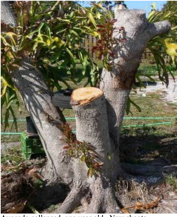
Avocado collapsed, one year old. New shoots will collapse.