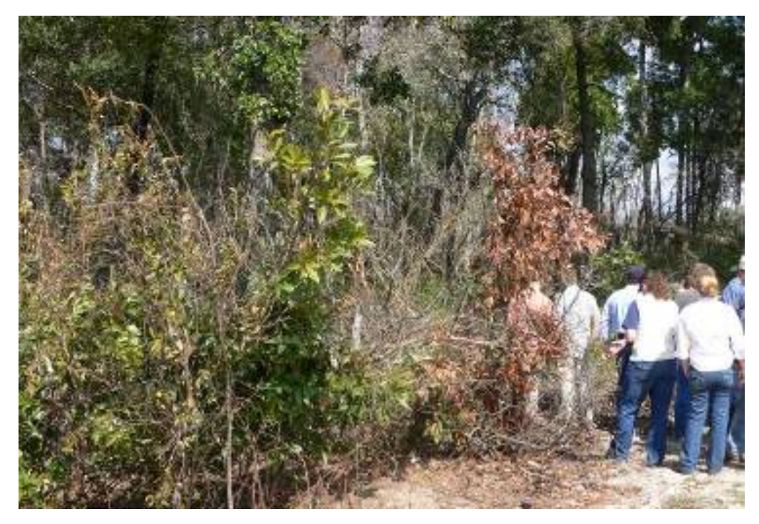
Red bay (P. borbonia) in collapse.