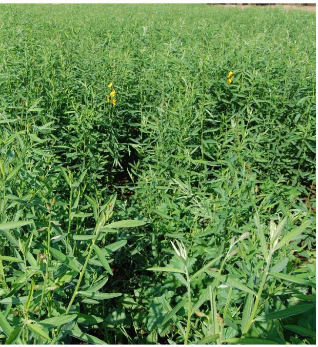
Sunnhemp (Tropic Sun), Lockeford PMC.