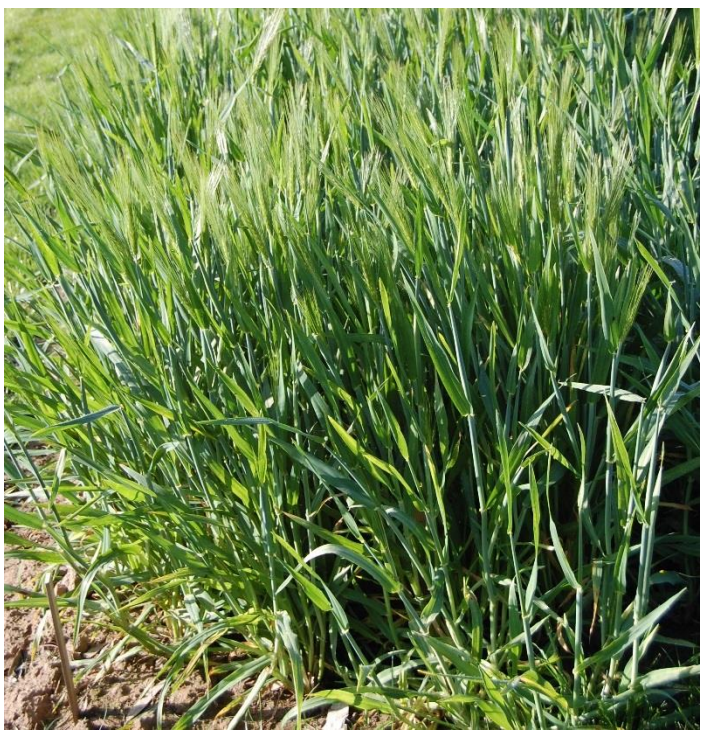
Barley (UC 937) 150 days after planting, Lockeford PMC.