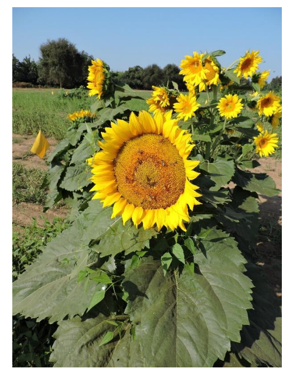
Sunflower (black), Lockeford PMC.

https://plants.usda.gov/plantguide/pdf/cs_hean3.pdf http://ipm.ucanr.edu/PMG/GARDEN/FLOWERS/sunflo wer.html