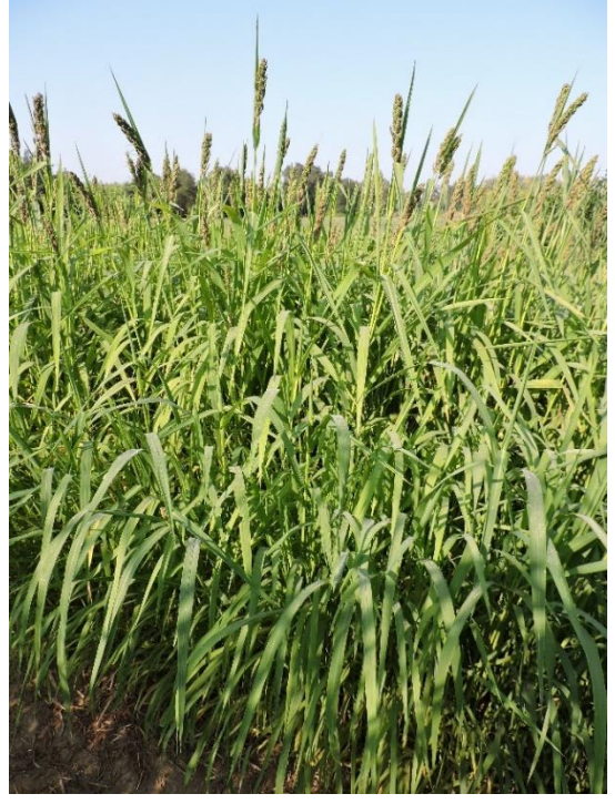
Japanese millet, Lockeford PMC.