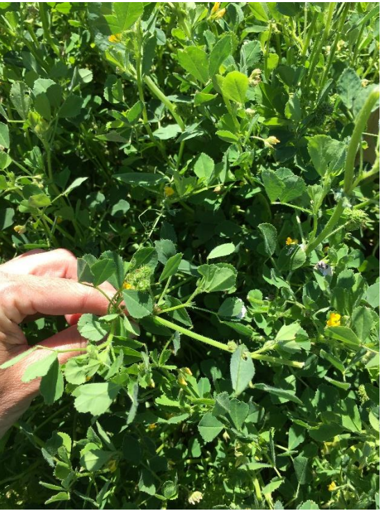
Barrel Medic (Sultan), Lockeford PMC.