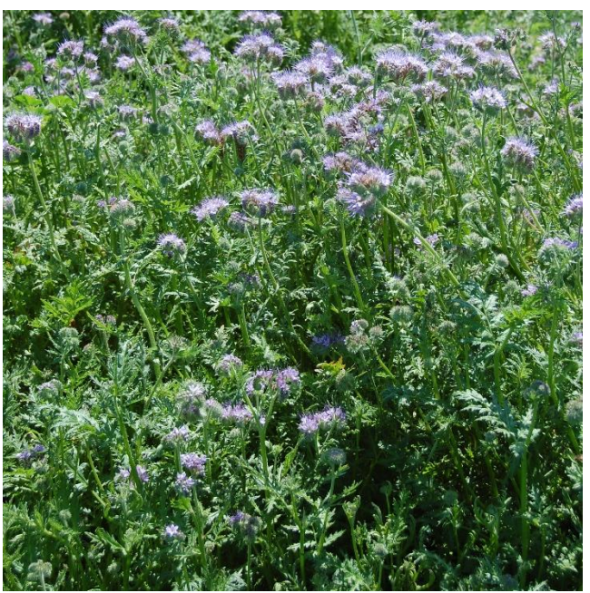
Lacy Phacelia, Lockeford PMC.

Lacy phacelia - Phacelia tanacetifolia Benth.