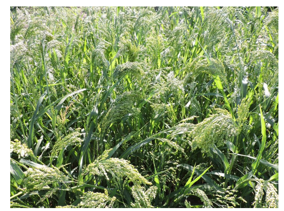
Proso millet, Lockeford PMC.