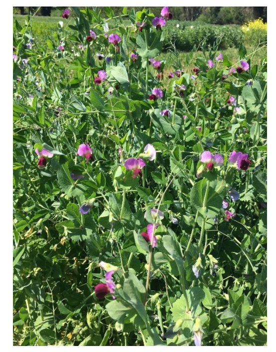
Field pea (Dundale), Lockeford PMC.