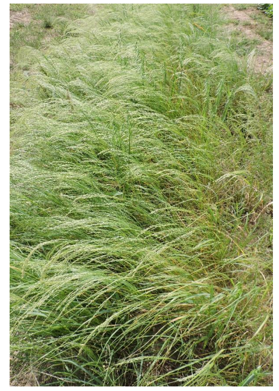
Teff (Excalibur), Lockeford PMC.

http://eol.org/pages/1114367/overview http://covercrops.cals.cornell.edu/Teff.php