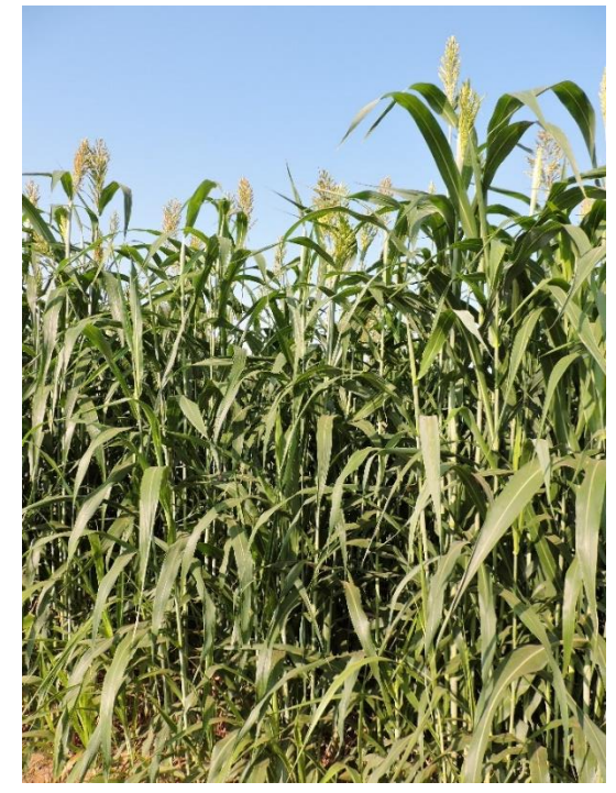
Sorghum, Lockeford PMC.