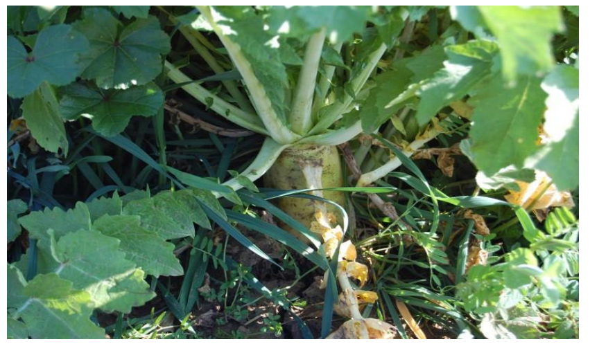
Mature radish plant showing large tap root, Lockeford PMC.

Plant Guide for Oilseed Radish ( Raphanus sativus ) http://covercrops.cals.cornell.edu