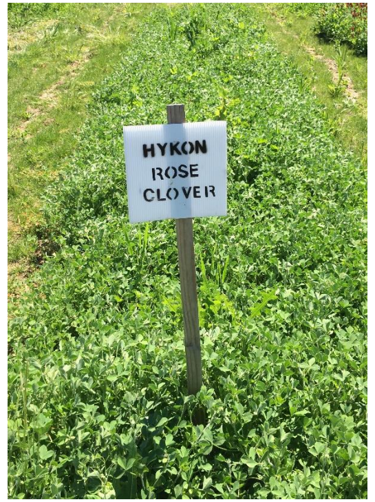
Rose clover, Lockeford PMC.