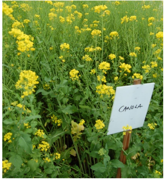
Canola at Lockeford PMC.