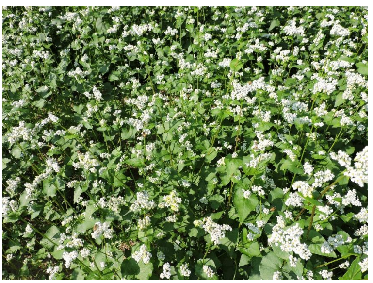
Buckwheat, Lockeford PMC.