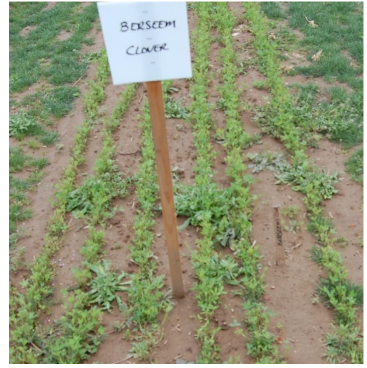
Berseem clover, Lockeford PMC.