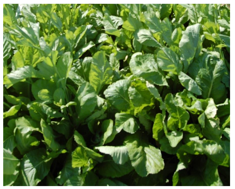
Oriental mustard, Lockeford PMC.

UC SARAP Cover Crop database http://covercrops.cals.cornell.edu