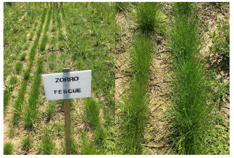
Annual fescue (Zorro), Lockeford PMC.

http://plants.usda.gov/plantguide/pdf/pg_vumy.pdf 'Zorro' Annual Fescue Release Brochure UC SARAP Cover Crop database