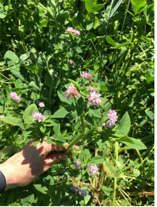
Persian clover (Lightning), Lockeford PMC.