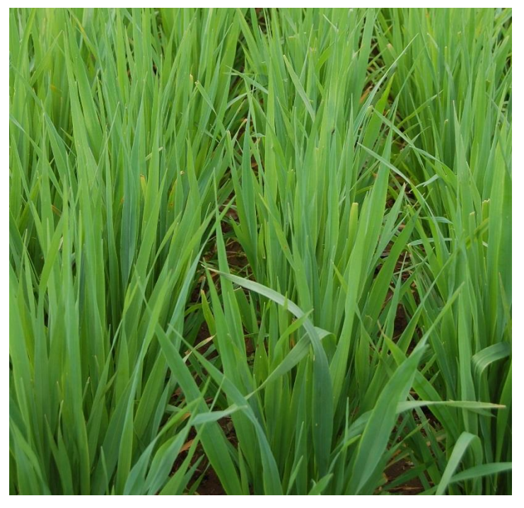
Oats (Cayuse) 120 days after planting, Lockeford PMC.