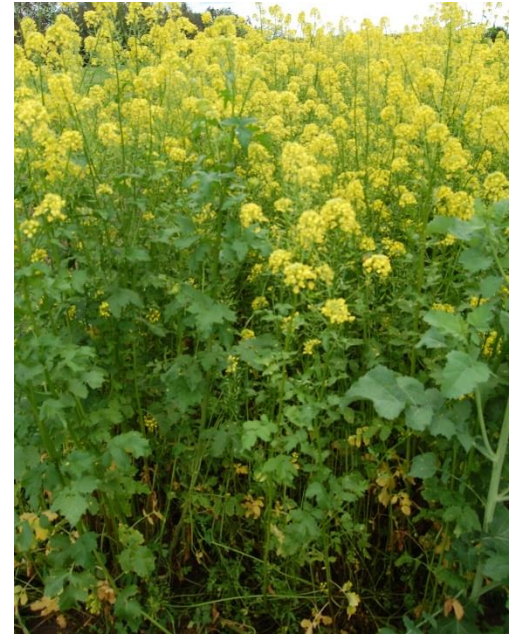
Common mustard, Lockeford PMC.