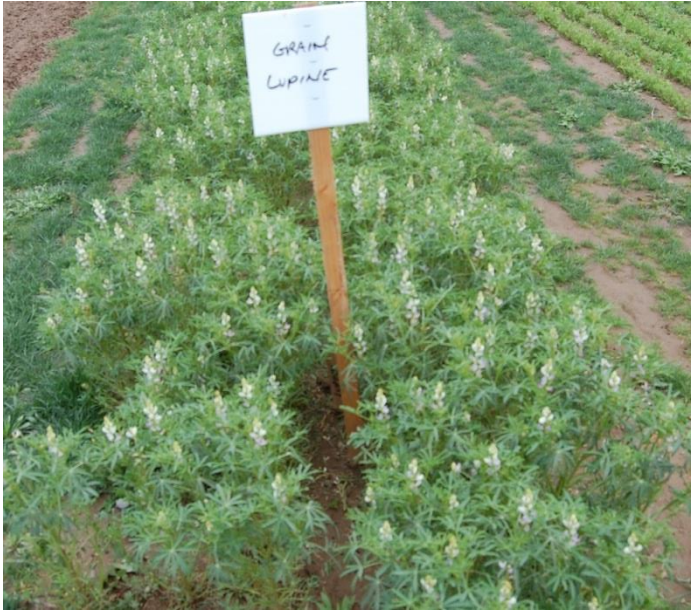
Grain Lupine Lockeford PMC.