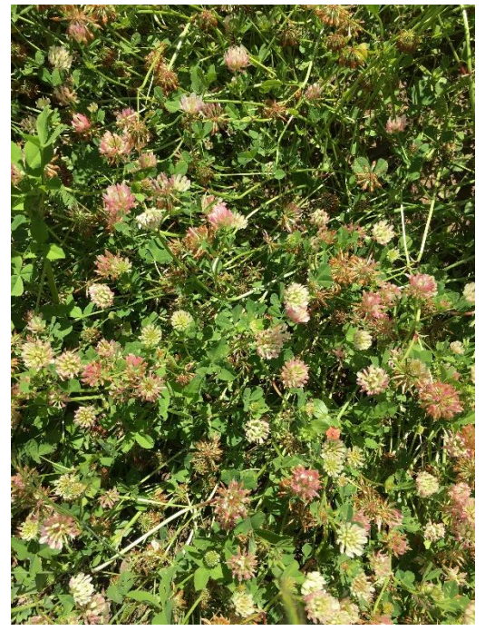
Balansa clover (Frontier), Lockeford PMC.