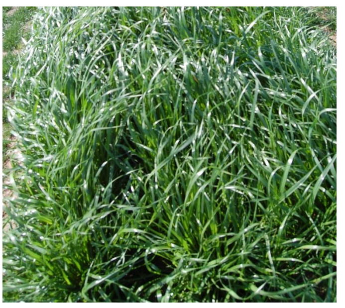
Common annual ryegrass, Lockeford PMC.

UC SARAP Cover Crop database http://covercrops.cals.cornell.edu