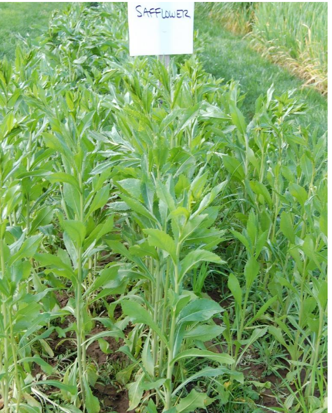
Safflower, Lockeford PMC.

https://ipmdata.ipmcenters.org/documents/cropprofil es/Safflower%20Crop%20Profile%203-1-2016%20MB.pdf