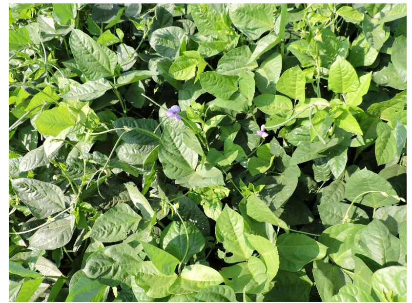
Cowpea (Red Ripper), at Lockeford PMC.