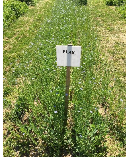
Flax, Lockeford PMC.