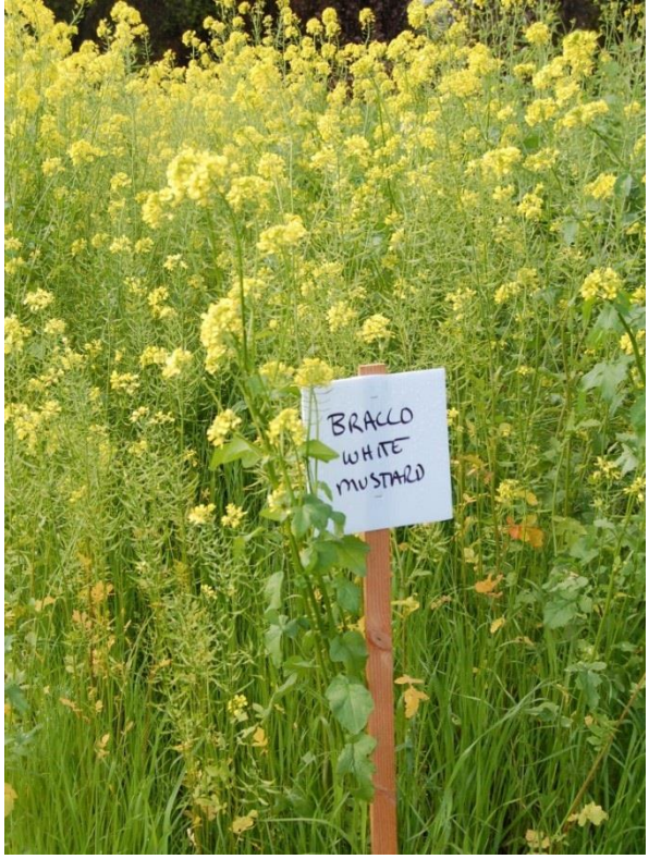
White Mustard (Bracco), Lockeford PMC.