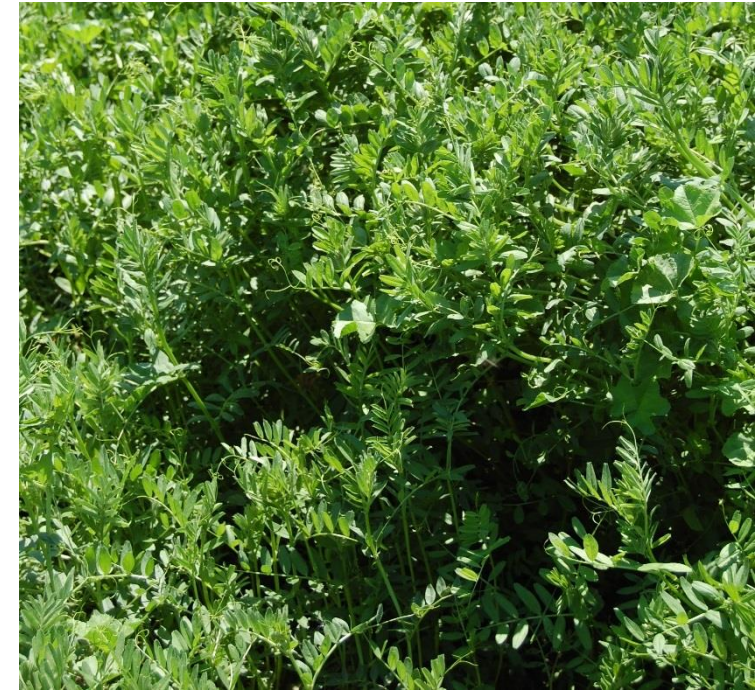
Common vetch, 165 days after planting, Lockeford PMC.