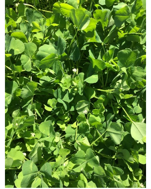
Subterranean clover (Antas), Lockeford PMC.