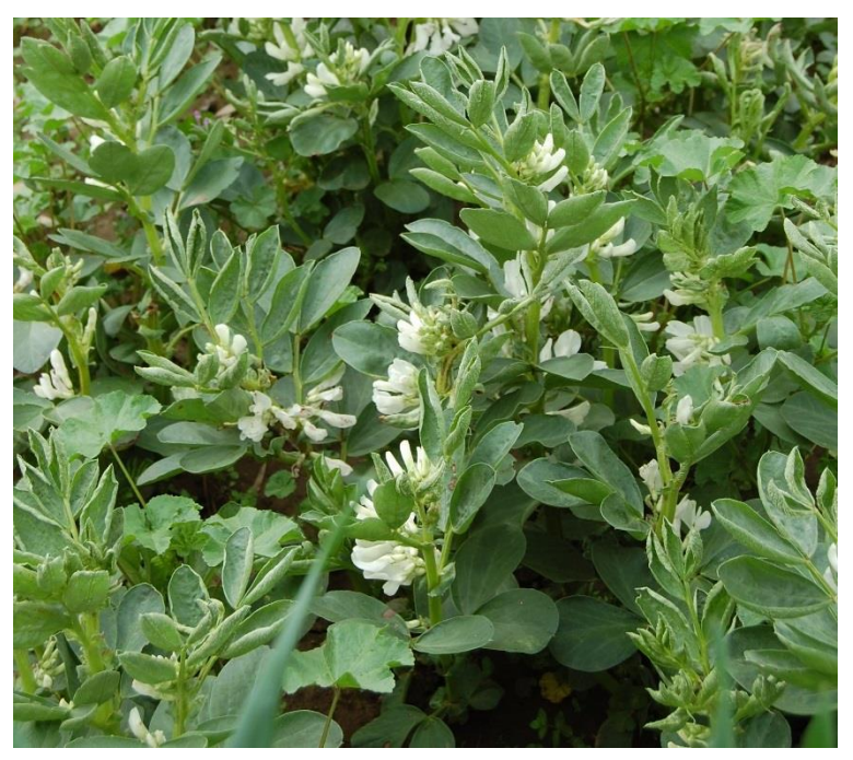
Bell bean, Lockeford PMC.