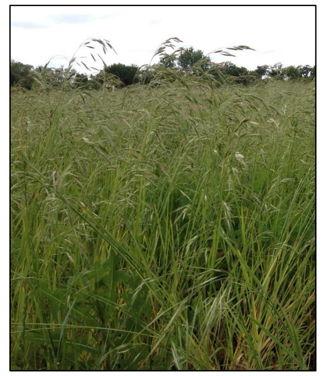
'Cucamonga' California brome, Lockeford PMC.

<u>'Cucamonga' California Brome Release</u> Brochure <u>UC SARAP Cover Crop database</u>