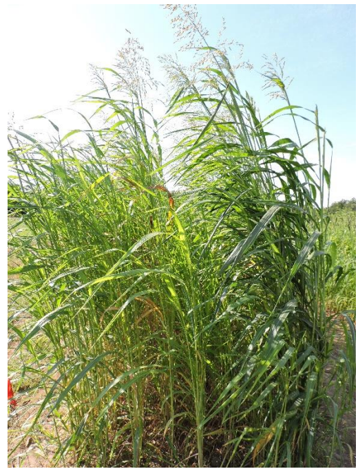
Sudangrass (Piper), Lockeford PMC.