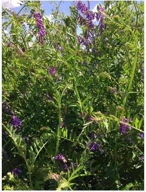
Woollypod vetch (Lana), Lockeford PMC.

https://plants.usda.gov/plantguide/pdf/pg_viviv8.pdf 'Lana' Woollypod Vetch Release Brochure