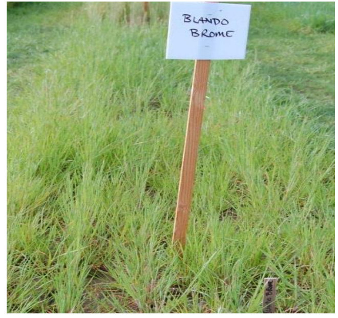
'Blando' soft brome, Lockeford PMC.

<u>'Blando' brome Release Brochure</u> <u>UC SARAP Cover Crop database</u>