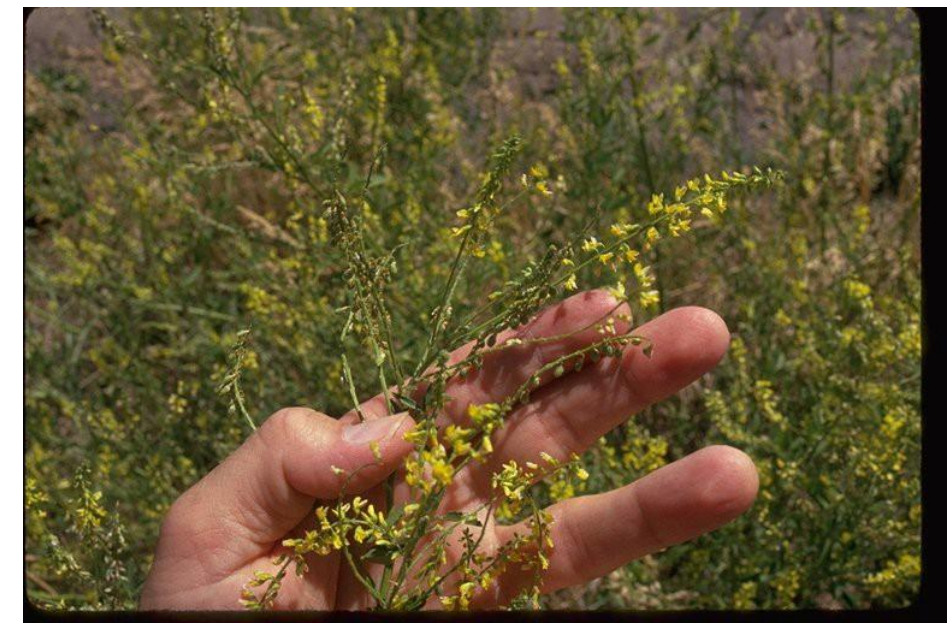
Sweetclover SARE – Agriculture Sustainability Institute at UC Davis, CA.