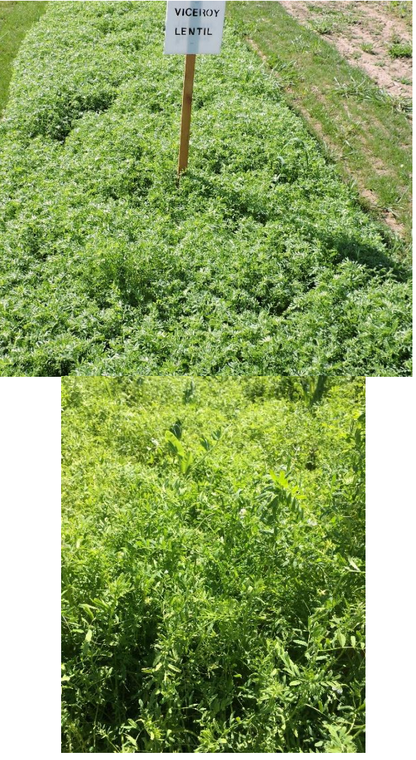
Lentil (Viceroy), Lockeford PMC.

https://plants.usda.gov/plantguide/pdf/pg_lecu2.pdf http://www.ag.ndsu.edu/pubs/plantsci/rowc rops/a1636.pdf