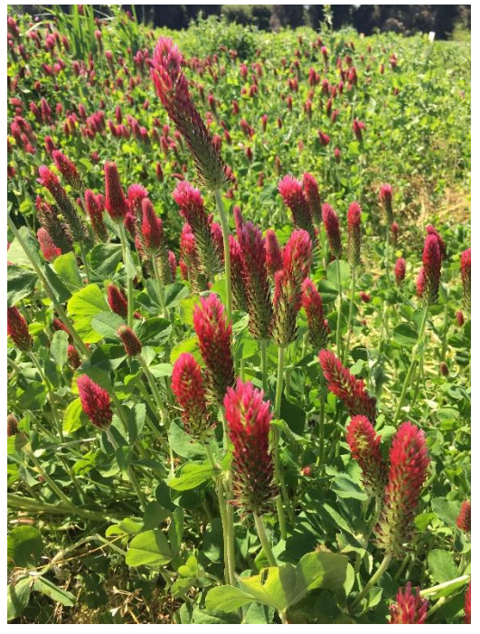
Crimson clover, Lockeford PMC.