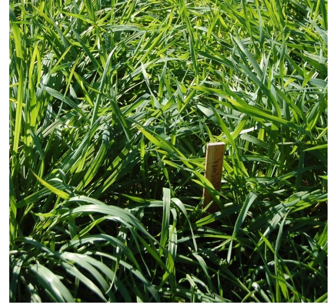
Wheat (Yamhill) 120 days after planting, Lockeford PMC.