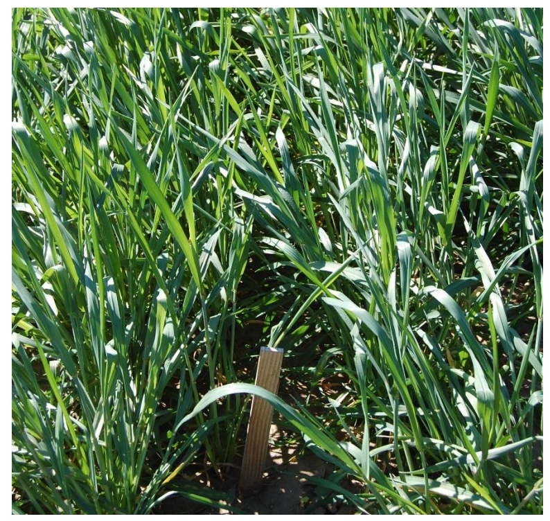
Triticale (Juan) 120 days after planting, Lockeford PMC.