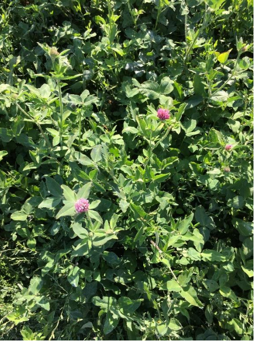
Red clover, Lockeford PMC.

https://plants.usda.gov/plantguide/pdf/pg_trpr2.pdf http://covercrops.cals.cornell.edu