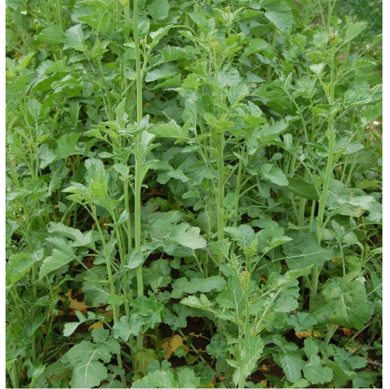
Brown mustard (Nemfix) 135 days after planting, Lockeford PMC.

UC SARAP Cover Crop database http://covercrops.cals.cornell.edu