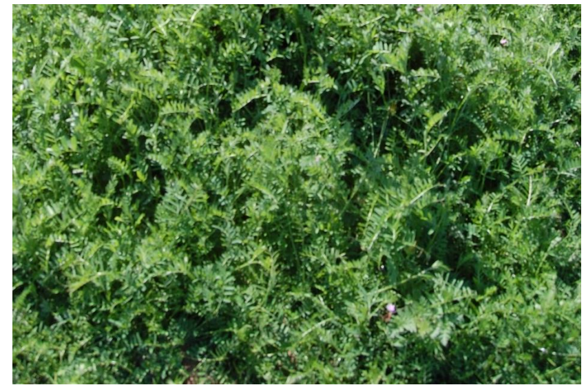
Hairy vetch, Lockeford PMC.