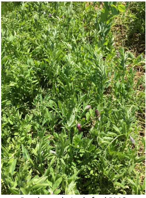
Purple vetch, Lockeford PMC.