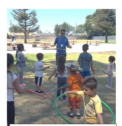
SLOSB staff leading CATCH activities during the Summer Food Program

In a focus group conducted in June 2016 with parents from the Santa Maria-Bonita School District, parents commented that they would like more information and ideas about how and where to do physical activities as a family. Participants commented that they appreciated that their children were learning how