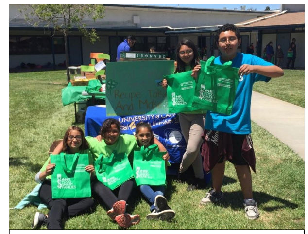
SNAC Leaders setting up for the Food Smart Families healthy recipe food distribution.

active and inclusive during recess. One of the SNAC clubs led food demonstrations to younger 5<sup>th</sup> grade students during their recess time. At each of the three SNAC sites, leaders taught nutrition lessons from