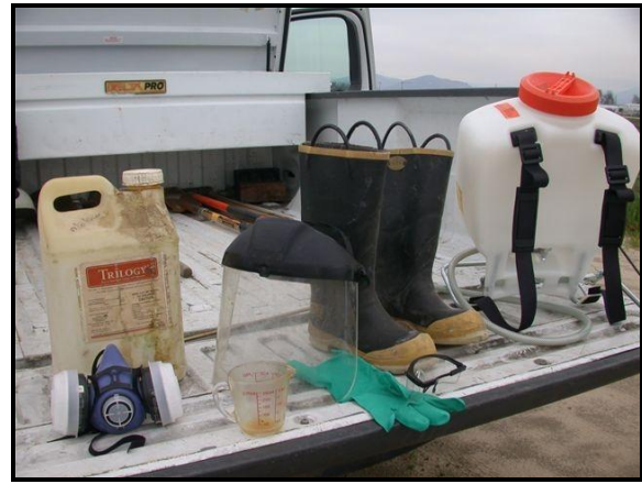
Recommended minimum protection

___10. Minimum protective equipments are gloves, goggles, shoes or boots, long sleeves shirt, and long pant