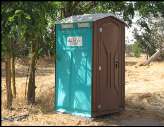
Fig. 1 – Mobile Toilet at Sam Saechao’s Strawberries Farm

Cal/OSHA consultation is free of charges. Cal/OSHA keeps all finding confidential, and reports its findings to the Enforcement Division only if the employer repeatedly fails to take proper corrective actions 18