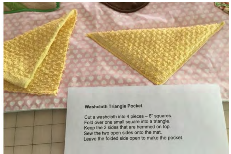
Washcloth triangle pocket