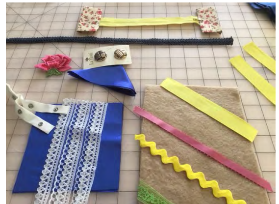
Add-ons before construction