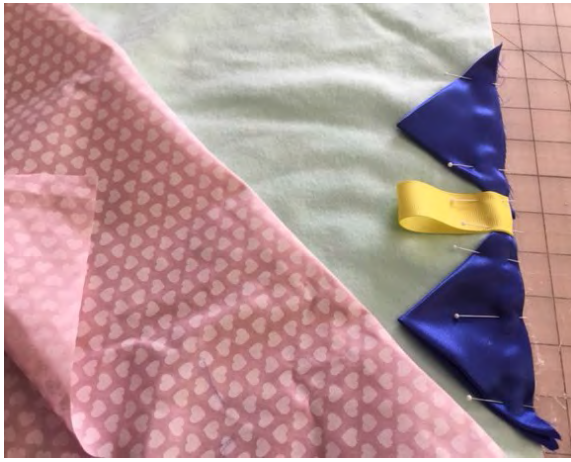
Adding edge pieces