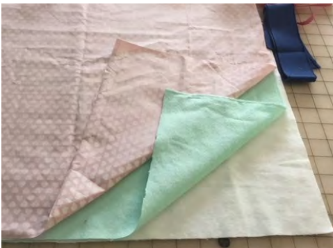
Basic mat layers