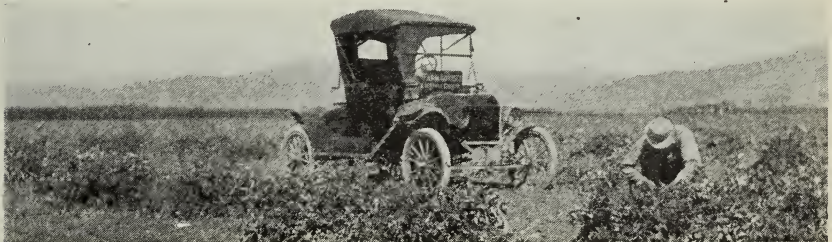
(3) Investigation into the larger problems of farm management.

(Boys' Agricultural Club on a tour with the Yolo County Farm Adviser.)