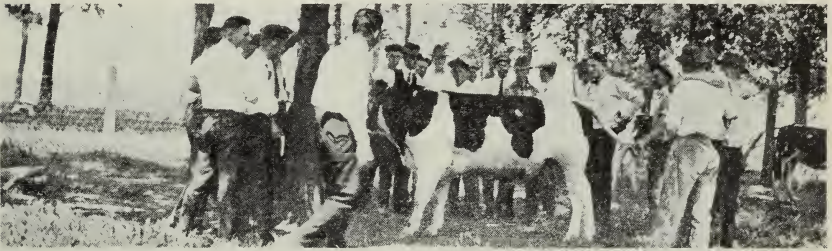
(2) Organization of the civilizing forces of the community.

(Advising a new homesteader on the edge of the Mojave Desert, Kern County.)