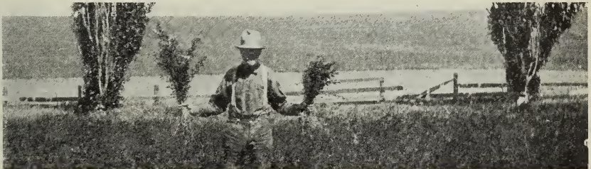
(4) Demonstration of these principles and practices through the co-operation of interested farmers.

(The farm adviser in the bean fields of Ventura County.)