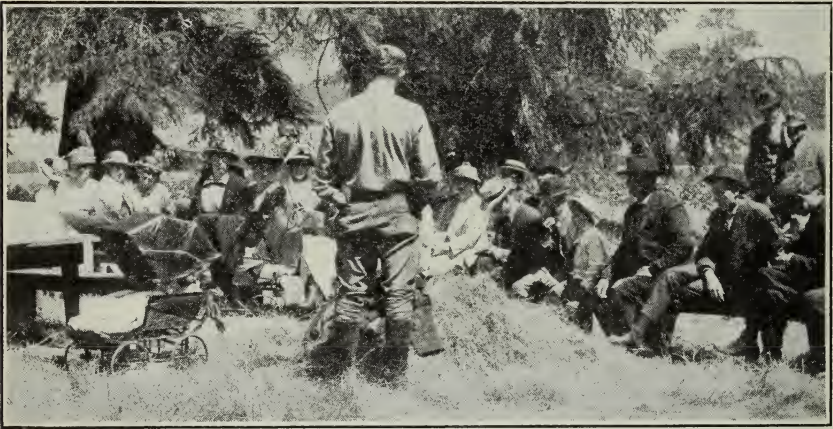
Each Farm Bureau center holds a meeting at the time of the monthly visit of the farm adviser.

The county farm bureau is organized around certain local district headquarters known as "farm bureau centers"—not more than thirteen being in any one county—where the farm adviser is due on regular schedule each month. Each farm bureau center has a director elected from among its members, to serve on the board of the farm bureau and to make engagements for the services of the farm adviser. Usually each farm bureau center holds a meeting at the time of the regular monthly visit of the farm adviser in order that all may have the benefit of his discussions of local problems. Often the farm bureau engages in many other plans and projects, as discussed in Circular No. 118, "The County Farm Bureau."