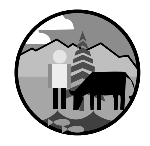
California Rangelands Research and Information Center