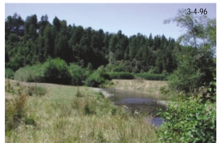
Figure 3. Riparian area photographed before and after installation of a fence.

Event photos can be used to document unplanned or unusual events such as fires, floods, erosion, wildlife damage, and vandalism (Figure 4), and practice photos can be used to document management practices (Figure 5). You can use "before and after" photos to document the implementation and effectiveness of practices, the effects of fire and post-fire recovery, the invasion and control of weeds and shrubs, and other long-term changes.