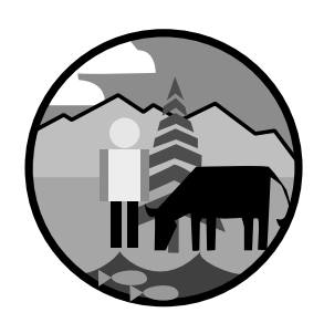
California Rangelands Research and Information Center

http://agronomy.ucdavis.edu/ calrng/range1.htm