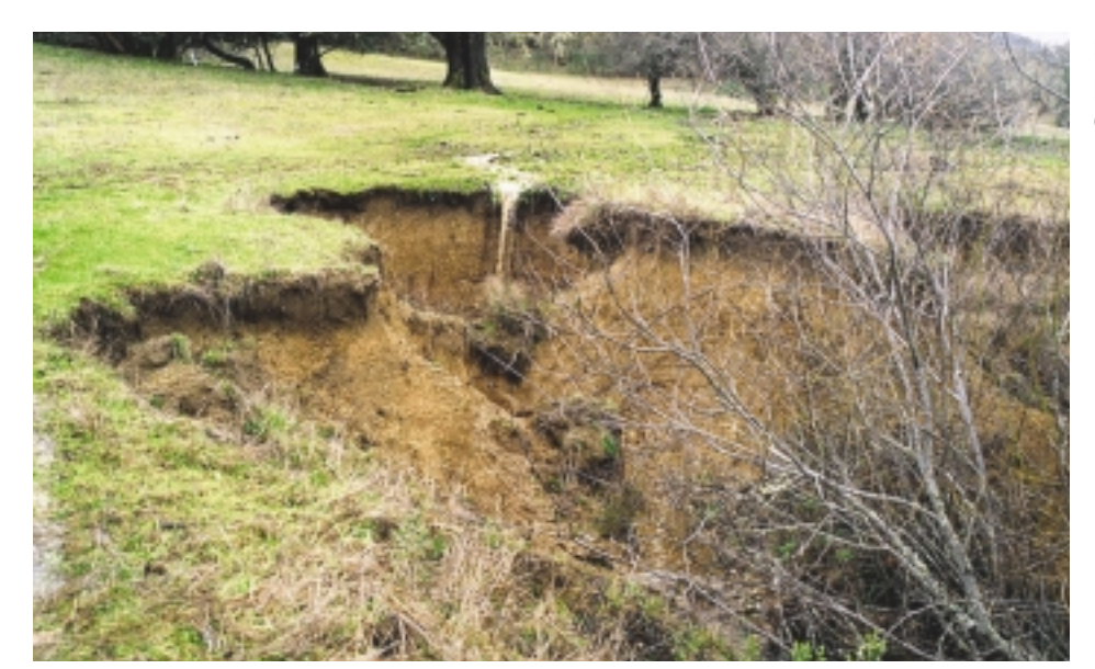
Figure 5 . "Before and after" photographs to show the effect of a practice.