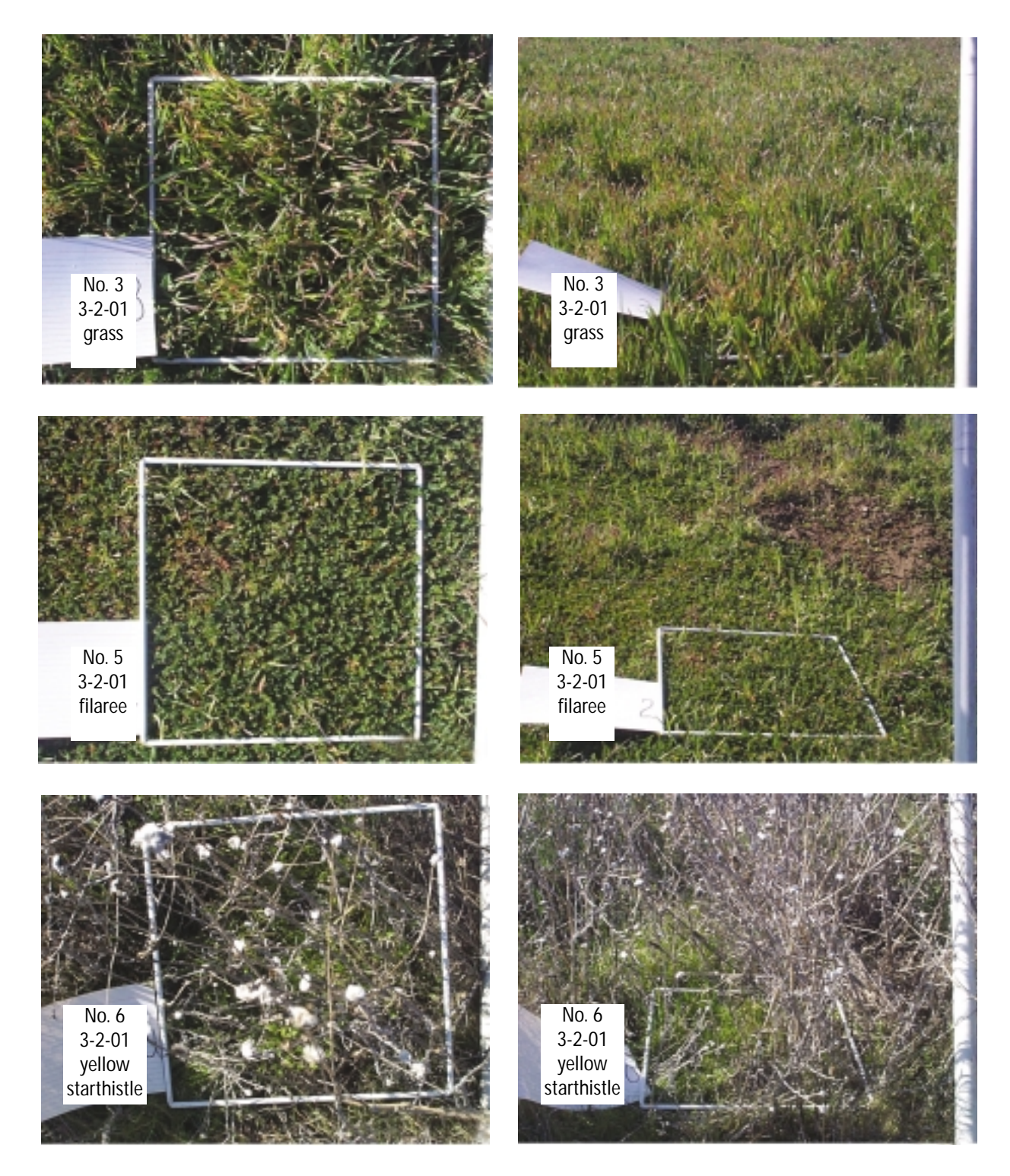
Figure 2. Close-ups of 1-square-foot plots.