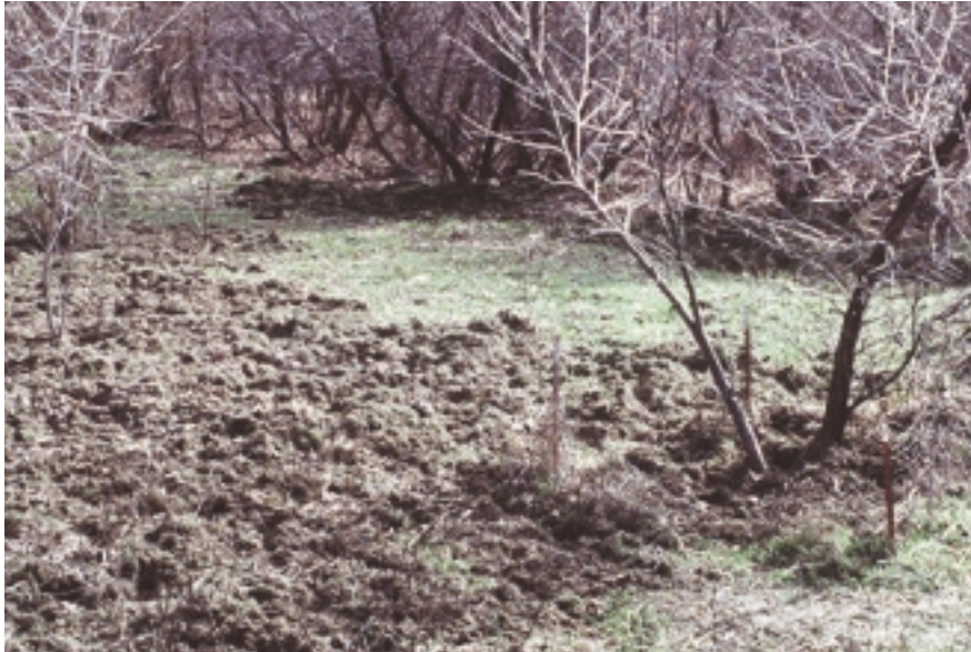
Figure 4. Photos taken to document events (gully formation and rooting by feral pigs).