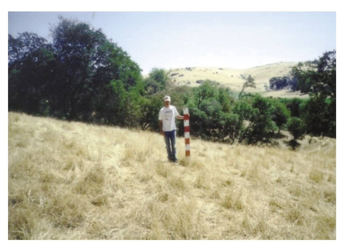
Figure 7. You can use a profile board to indicate scale in a photograph.

Take as many photos as necessary to adequately document landscape conditions. For example, you may need to take upstream, downstream, and across-stream photos in order to thoroughly document riparian conditions along a stretch of a stream. Within each picture, include a photo ID card to record the date and photo point number. Be sure the writing is large and legible. An 8.5 \times 11 inch sheet of paper with large, thick writing from a felt-tip pen should be adequate. Some cameras are equipped with a date stamp, which simplifies record keeping. To provide scale in photographs, especially close-ups, you may want to include a profile board (Figure 7) or other object of a known size in the picture. Any object with delineated measurements that will be visible in a photograph is adequate. If you place another permanent marker such as a steel post or a length of rebar where the profile board appears, it will be easier for you to put the profile board in the same position the next time you take pictures. Alternatively, you could place the profile board a known distance in a known direction from the photo point.