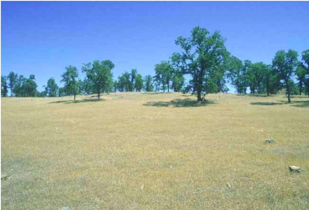
Oak woodland and annual grassland mosaic