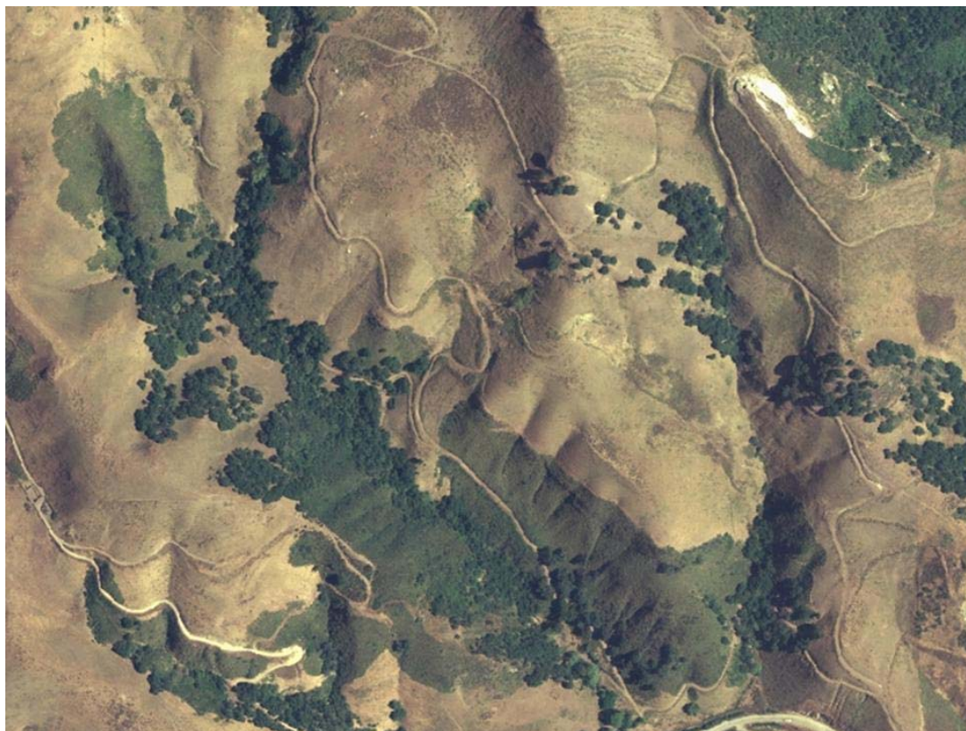
Coastal Fine Loamy Ecological Site