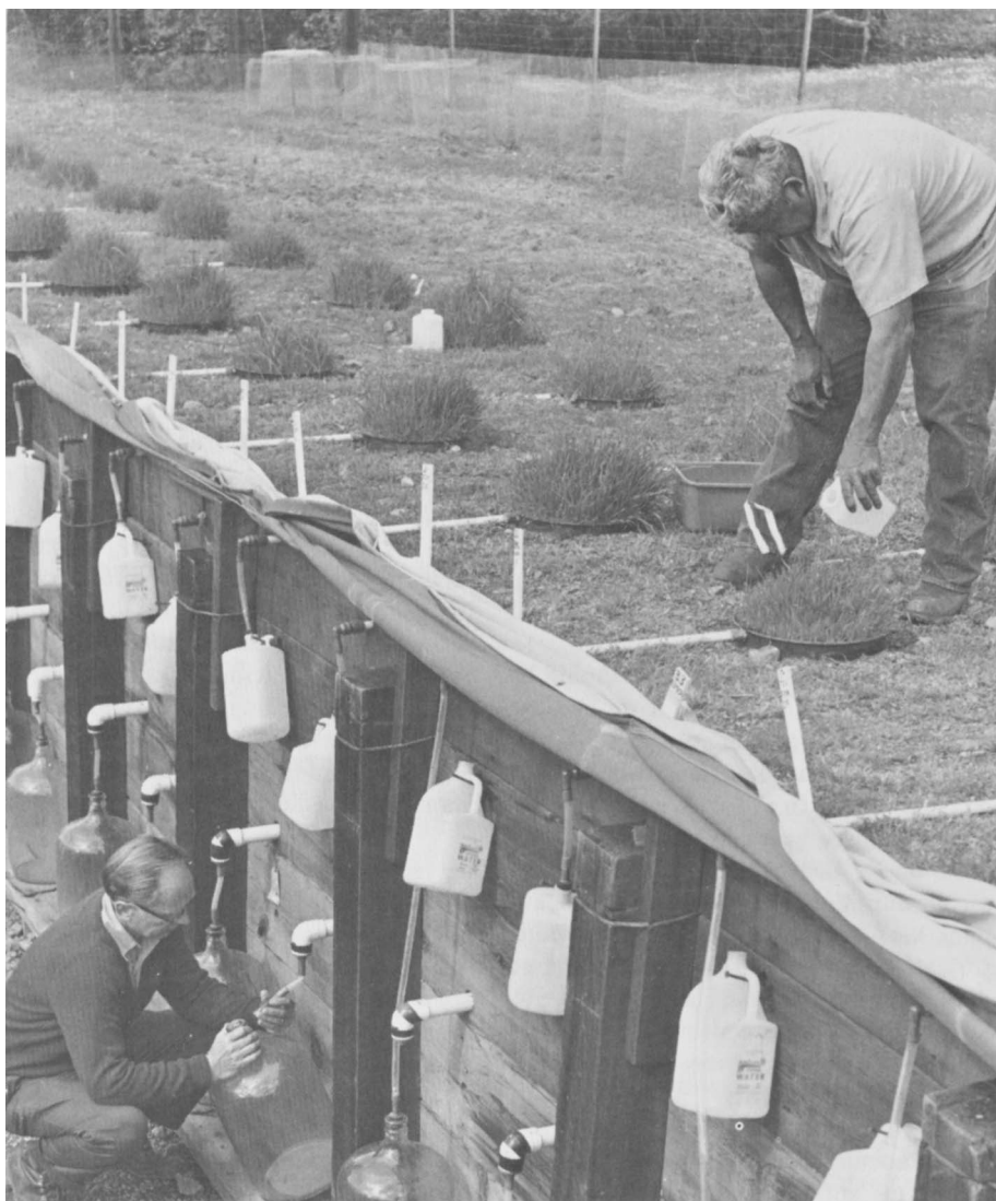
A lysimeter helps scientists determine loss of soil nutrients by leaching from different soil-plant combinations.