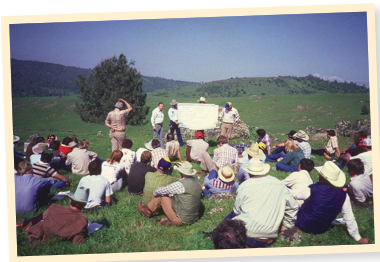
FIGURE 5. A field day on Forbes Hill at the Sierra Foothill Research and Extension Center in the 1980s.