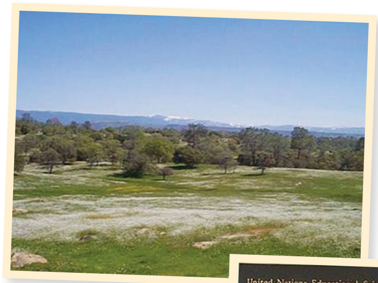
FIGURE 3. San Joaquin Experimental Range in Madera County, California.