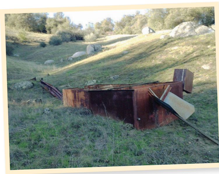
FIGURE 1. Remnant of the Veihmeyer flume near Ahwahnee, Madera County, California.