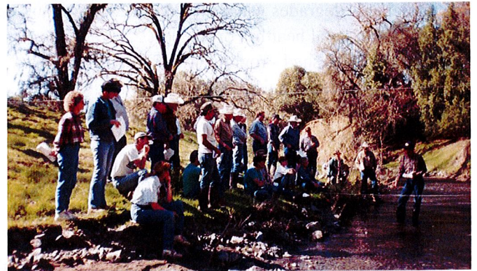
Figure 2: Water Quality Planning Short Course, Mendocino County