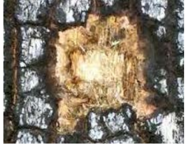
Dead trees will have Brown, Dry, dark colored wood under the bark