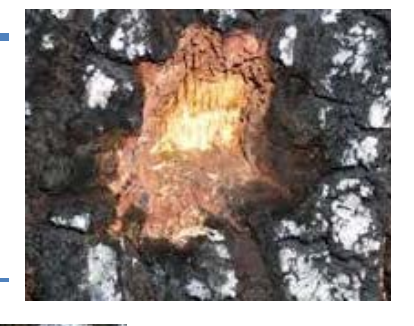
Surviving trees have Pink, Moist, and light colored wood under the bark

The cambium is completely dead around the base of the tree. To check, cut small openings in the bark to expose the cambium layer underneath.