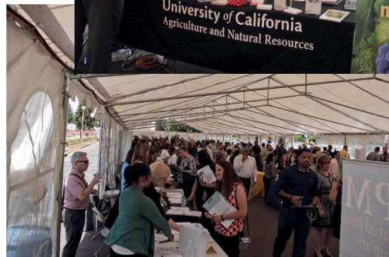
The Job Fair was well attended