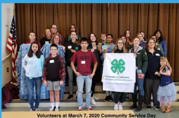
Volunteers at March 7, 2020 Community Service Day