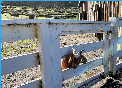
"Hey, where are all the kids?" (not the goat kind ;-)

For those who were not aware, Elkus Ranch suffered serious storm damage over New Year's weekend. Purisima Creek's flooding waters washed away our access bridge and water pumping station. The road to recovery has been slow (to say the least) due in part to insurance and UC contractual issues. Sadly, Elkus remains closed to the public with limited access via a gas powered man-lift which can carry 2 persons at a time, moving at a snails pace. Staff are on-site daily to care for the animals - who truly miss having visitors - and regular chores, including hand pumping water into a 500 gal. tank which is then transported up to our water treatment system for use. Lots of challenges but we look forward to the project's completion and resuming activities. We have every intention to host both Sheep to Shawl and Summer Camp and hope to see you then if not before! Thank you for your patience and support.