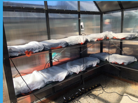
MGs & seedling preparation in the greenhouses.