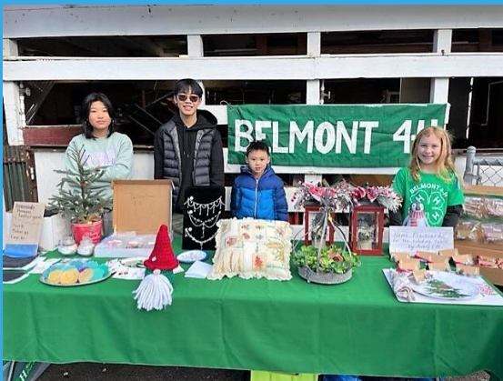
Winter Craft Fair - Dec. 2022