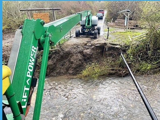
View from Elkus across the creek to man-lift.