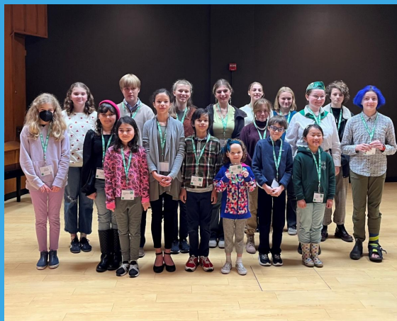
Presentation Day Participants - Feb. 2023

Presentation Day is a fun opportunity for 4-H members to showcase their knowledge in a subject of their choosing. 4-H'ers prepare a presentation that is judged on subject knowledge, presentation, organization, voice, manner and appearance, clarity, and the ability to answer questions. More than twenty youth participated in this year's Presentation Day, held at the College of San Mateo in February. Presenters talked about subjects ranging from making waffles to sewing ballet shoes and caring for special needs chickens!