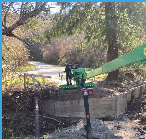
Staff crossing the creek in the man-lift machine.