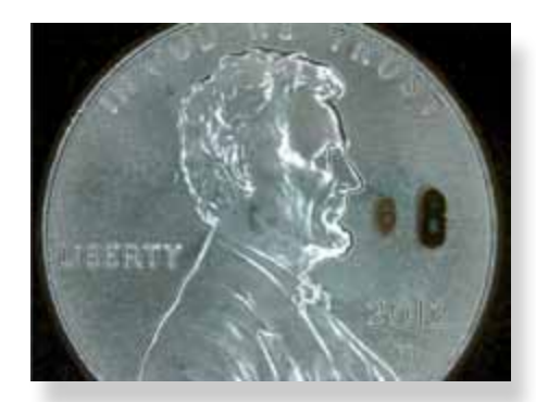
Figure 10: Male (left) and female (right) beetles on a penny. (A. Eskalen).

The beetle is a new Euwallacea species relative of the tea shot hole borer (an exotic Asian ambrosia beetle). It is very small and difficult to see (Fig. 10). The beetle holes penetrate approximately 0.4-1.57 inch into the wood and there are often many entry/exit holes on an infested tree. The exit hole on avocado is about 0.033 inch wide (Fig. 8). Females are black colored and about 0.07-0.1 inch long (Fig. 11), males are brown colored and about 0.05 inch long (Fig. 12).