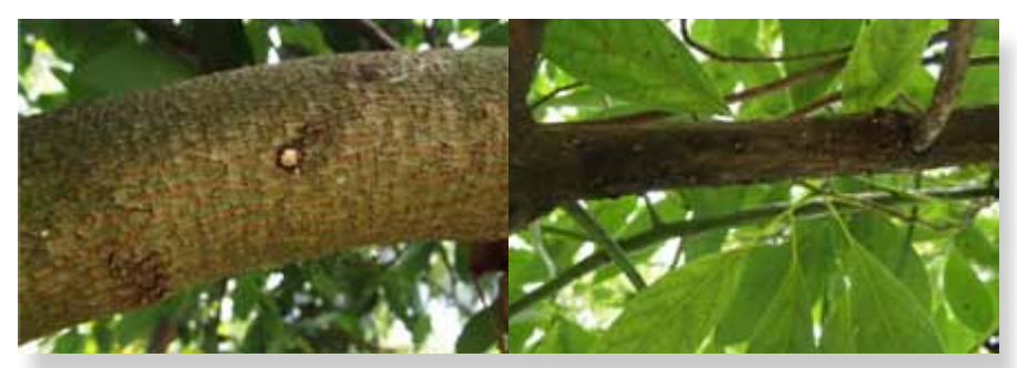
Figure 6: A singe entry/exit hole covered by sugar exudate. (A.Eskalen)