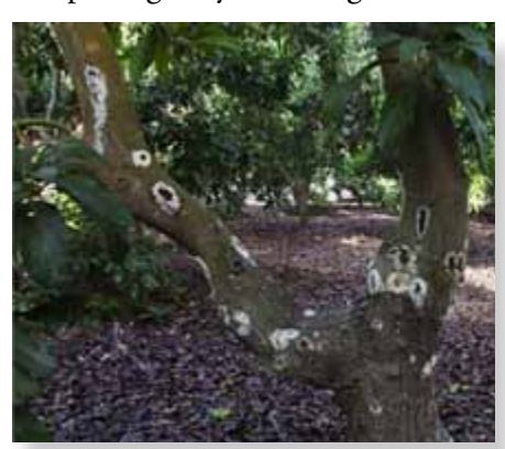
Figure 1: An avocado tree in Israel exhibiting symptoms of beetle/disease (Mendel et al. 2012)

Recently a new beetle/disease complex was detected that Causes a Fusarium dieback on avocado and other host plants in and near Los Angeles County. The disease is caused by a new, yet unnamed Fusarium sp. that forms a symbiotic relationship with a recently discovered Euwallacea sp. beetle, which serves as the vector. This beetle is morphologically indistinguishable from the tea shot hole borer, Euwal-