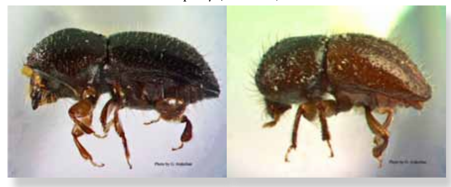
Figure 11: Female beetle Euwallacea sp., 0.07 to 0.1 inch long and black. (G. Arakelian). Figure 12: Male beetle Euwallacea sp., 0.05 inch long and brown. (G. Arakelian).