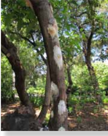
Figure 5: Limb damage showing sugar exudate (A.Eskalen)