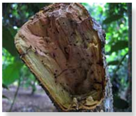
Figure. 2: A failed main branch of avocado in Israel caused by the Fusarium dieback (Mendel et al. 2012)

Unlike the Redbay Ambrosia beetle, the vector of the Laurel wilt disease which has been infesting avocado and other members of the avocado family (Laureceae) in the Southeastern United States, the new beetle has been observed on more than 100 different plant