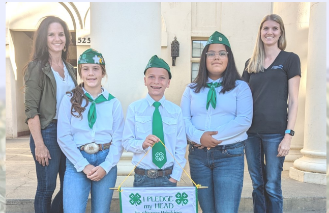
Glenn County 4-H YDP Staff and Youth Members during National 4-H Week Proclamation to the Glenn County Board of Supervisors.

Our Cooperative Extension (UCCE) county-based advisors, community educators, and campus-based academics work as teams to bring practical, trusted, science-based solutions to our state. We are problem solvers, catalysts, collaborators, educators, and stewards of the land, living in the communities we serve.