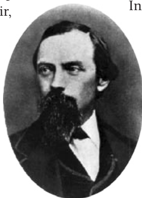
Professor Hilgard established the Jackson Experiment Station, source of some of the oldest Pinot noir selections at FPS.

FPS 27 is from a selection imported from Geisenheim, Germany in 1968. It was registered from 1974 to 1980, when it was removed because it tested RSP + . Tissue culture has been used to create FPS 105 from FPS 27. FPS 105 was planted in the foundation vineyard in 2003. We expect to start distributing FPS 105 in about 2005.