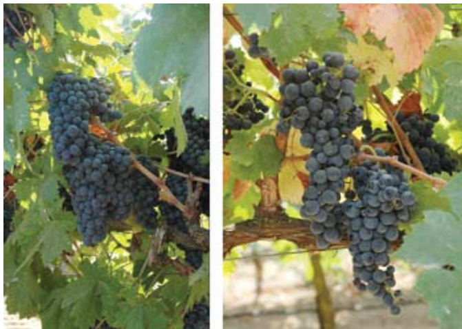
Zinfandel (left) and Primitivo in a comparative field trial in Lodi, California.

Finally, a study to compare 63 Zinfandel clones and field selections was initiated in 1995 on vines grown in the Zinfandel Heritage Vineyard located at the University of California’s Oakville Experimental Vineyard in Napa