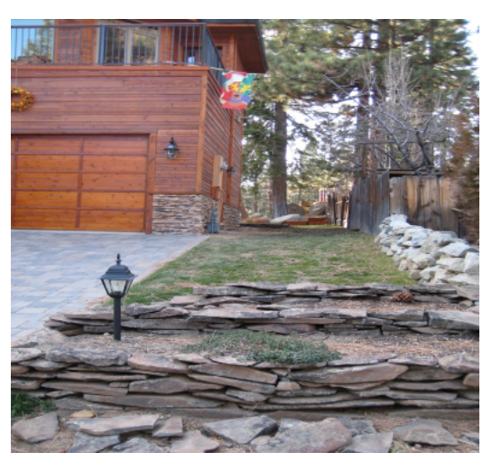
Figure 3. Rock mulch has been extended around the base of the house. Stone facing at the base of the house reduces the risk of having combustible wood siding.

If vegetation must be kept in this zone, it should consist primarily of irrigated lawn and low-growing herbaceous (non-woody) plants. Shrubs and trees, particularly conifers, are not recommended for use in this zone.