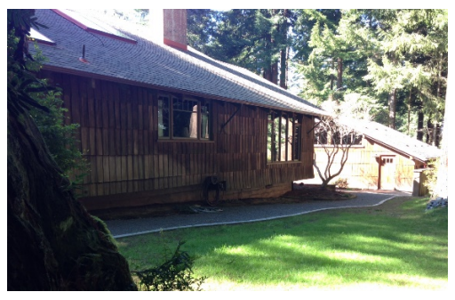
Figure 1. Vegetation has been separated from the house and its combustible siding by installation of an asphalt walkway. (not sure who took this picture)