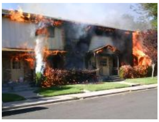
Figure 5. A cigarette thrown out the window into a 'foundation planting' of ornamental junipers burned this apartment in Reno

Any plant can be a risk, but some plants are riskier than others. Woody shrubs should be removed, especially conifers such as ornamental junipers. Fire fighters call these shrubs 'little green gas cans'! Large trees on the other hand, are more difficult to ignite, especially if their limbs have been trimmed back to at least 10 feet from the home.