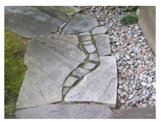
Figure 2. A stone pathway and rock mulch has been installed to create a non-combustible zone