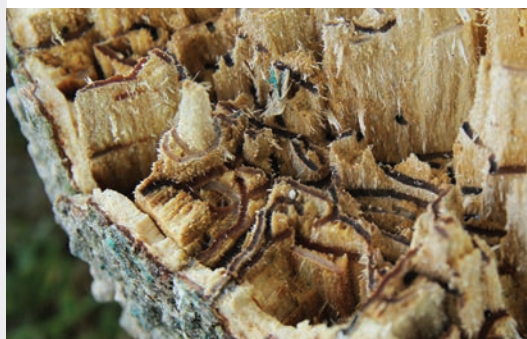
ISHB galleries in a box elder branch.