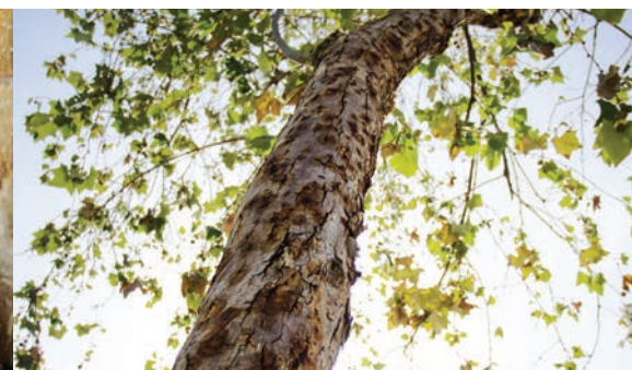
ISHB attacks on Mexican sycamore.