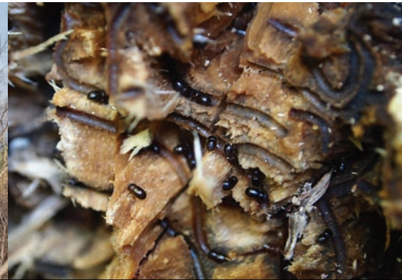
ISHB galleries in castor bean wood.

Two exotic, invasive beetles are causing increasingly extensive damage to Southern California's urban trees, native and riparian forests, and avocado groves. Thousands of severely affected trees have died or been removed in both natural and landscaped areas.