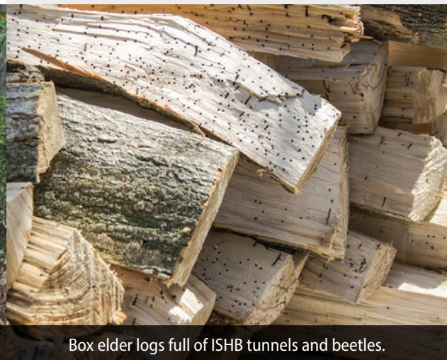
Box elder logs full of ISHB tunnels and beetles.