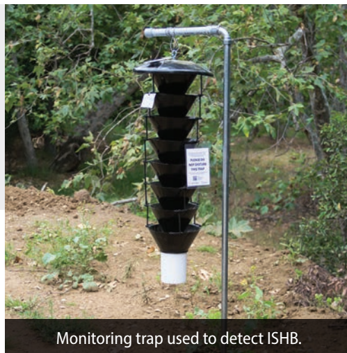
Monitoring trap used to detect ISHB.