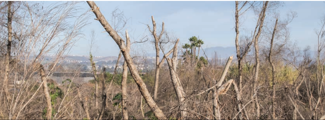
Willows in a San Diego creek devastated by ISHB.