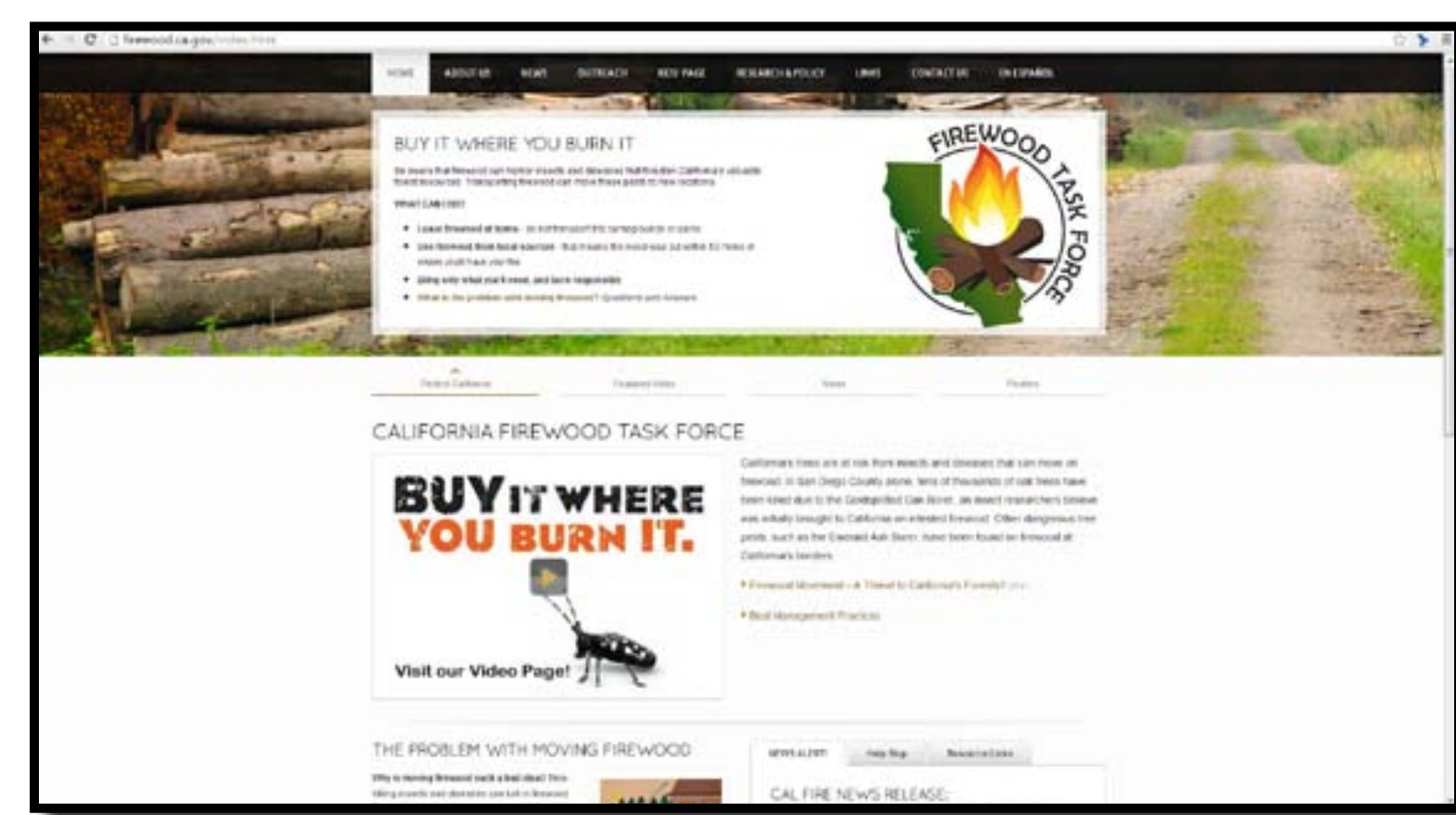
The website of the California Firewood Task Force, firewood.ca.gov

General Outreach: The primary focus of the statewide public outreach campaign has been campers and other outdoor recreationalists. In the summers of 2011 and 2012, Task Force members and partners distributed posters with the "Buy It Where You Burn It" message to campgrounds around California. In 2012, we increased our exposure with the purchase of 9 billboards on major travel routes. In addition, we have appeared at the California State Fair and other large outreach events.