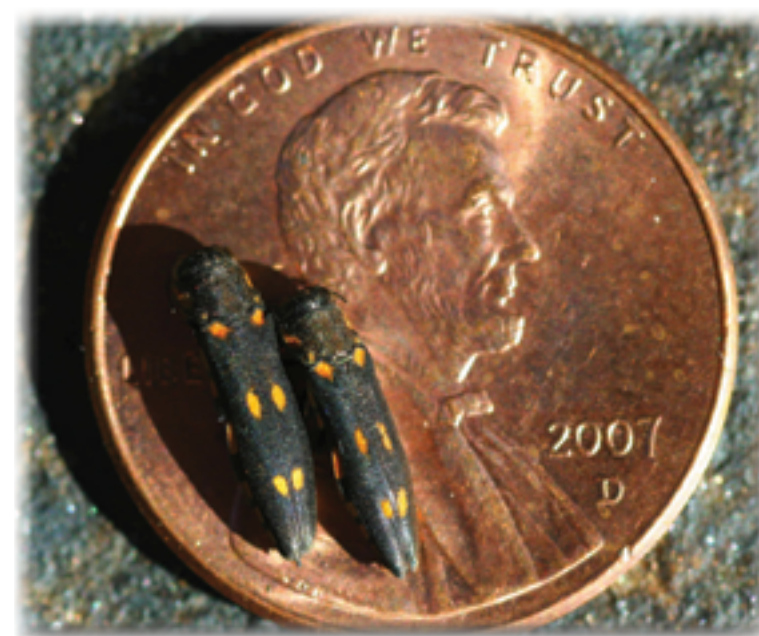
The goldspotted oak borer

The California Firewood Task Force came about through a resolution passed by the California Forest Pest Council in November 2010. Pests such as the Asian longhorned beetle and emerald ash borer are established in other states and would cause great harm if they became established in California. The gold spotted oak borer, sudden oak death and pitch canker are invasive pests that are established in parts of California and would cause additional harm if they became established in other parts of the state. Resource management professionals and scientists recognize that transport of firewood is one of the principal means by which many invasive pests are spread from one area to another. The Pest Council resolution highlighted this threat and called for the formation of a California-wide task force to address the issue. Organization of the Task Force began in January 2011 and its first meeting was held a month later. The Task Force is an "outreach partnership" supported by numerous agencies and organizations that promotes its Mission.