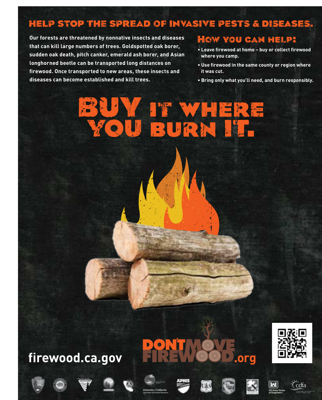
The standard campground poster from the 2012 outreach campaign

Giveaways: When we are able to deliver our message in person, we often leave the audience with a small token branded with our message. These have ranged from decks of playing cards to temporary tattoos to lip balm. We also have a small, postcard-sized handout for the public to take away.