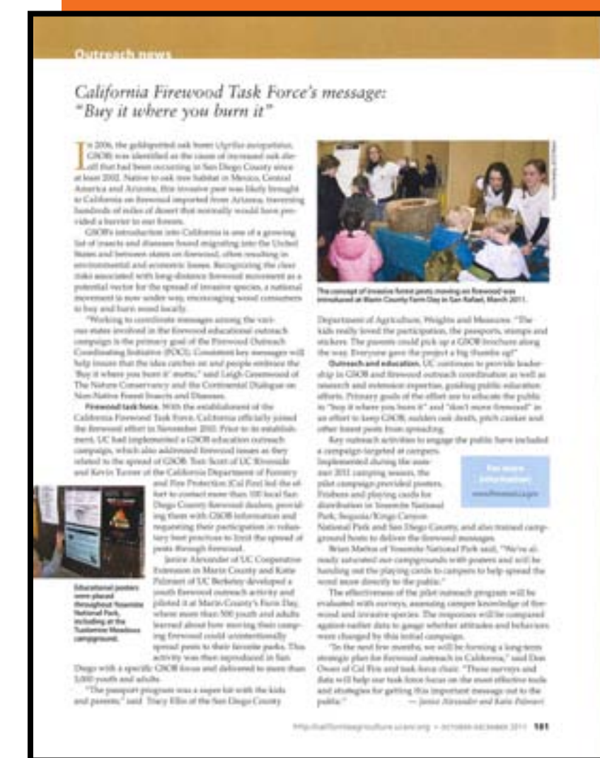
A California Agriculture article about firewood outreach