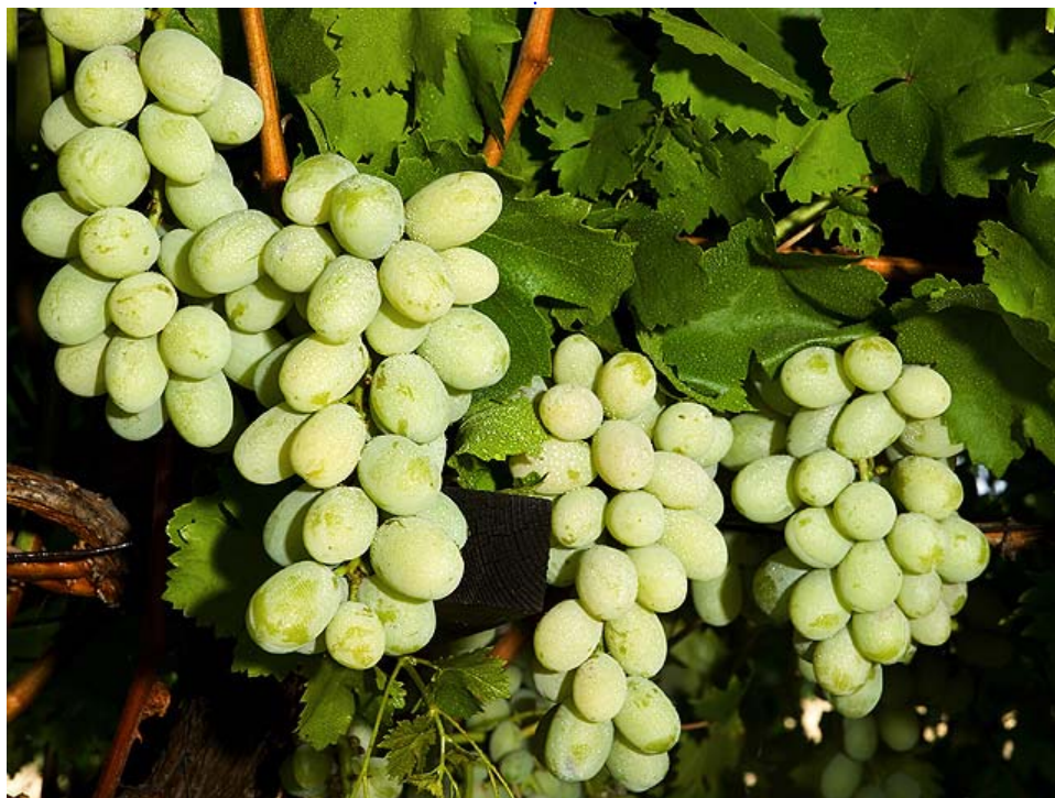
Autumn King produces naturally large berries with a sweet neutral flavor.