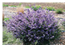
Ceanothus maritimus 'Valley Violet' - valley violet maritime ceanothus

California native plant; best small ceanothus for Central Valley gardens; clusters of dark-violet flowers bloom in spring; attracts beneficial insects. More Details