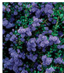
Ceanothus 'Concha' - concha ceanothus

California native plant; one of the best California lilacs for the garden with dark-green leaves all year; showy, deep blue flowers with reddish bracts bloom in spring; attracts beneficial insects. More Details