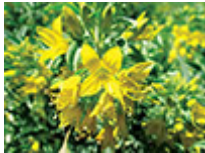
Isomeris arborea - bladderpod

California native plant; one of the only native shrubs that blooms year round; yellow flowers attract beneficial insects and hummingbirds to the garden and then develop into attractive seed pods.