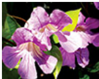
Clytostoma calystegioides - violet trumpet vine

Vigorous climber for covering walls and fences and can also be grown as a groundcover; trumpet-shaped violet flowers with purple veins blossom in late spring to summer; attracts hummingbirds.