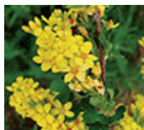
Ribes aureum - golden currant

California native plant; provides shelter and food for many native insects and other animals; tolerates high heat, drought, and alkaline soil; provides refreshing summer shade; attracts beneficial insects and birds. More Details