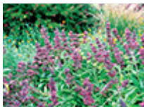
Salvia spathacea - hummingbird sage

California native plant; leaves have a pleasant, fruity fragrance; excellent drought-tolerant groundcover for sun or partial shade; attracts hummingbirds.