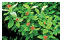
Calycanthus occidentalis - western spice bush

California native plant; maroon-red flowers attract pollinating beetles; leaves have a sharp, clean fragrance and turn yellow in the autumn, adding seasonal color to the garden.