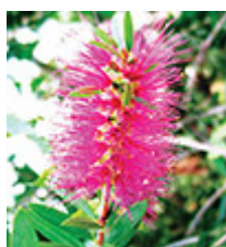
Callistemon 'Violaceus' - purple bottlebrush

Easiest orchid to grow in the Central Valley and plants spread to form small colonies over time; tough and hardy perennial that blooms dependably in shady gardens; vivid coloration and unusual shape give a tropical effect; attracts beneficial insects. More Details