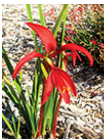
Sprekelia formosissima - Aztec lily

Dramatic, deep-red flowers attract hummingbirds in spring and summer; encourage blooming several times a year by withholding and then applying water; low maintenance.