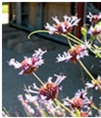
Salvia clevelandii 'Winnifred Gilman' - Winnifred Gilman Cleveland sage

California native plant; evergreen shrub produces maroon-stemmed, blue-violet flowers; heat and drought tolerant; attracts hummingbirds, butterflies and beneficial insects.