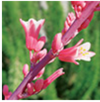
Hesperaloe parviflora - coral yucca

Adds a strong architectural note to the garden with its attractive spiky-looking leaves; very heat and drought tolerant; blooms all summer long; attracts hummingbirds.