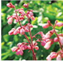
Heuchera 'Lillian's Pink' - Lillian's pink coral bells

California native plant; bright pink flowers attract bees and hummingbirds; excellent groundcover for small shady areas or borders.