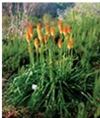
Kniphofia 'Christmas Cheer' - Christmas cheer poker plant

Dramatic plant brightens up the winter garden; at the top of its tall flowering stems, brilliant orange buds open to deep-gold tubular flowers; long, narrow leaves form an attractive, medium-large clump over time; attracts hummingbirds.