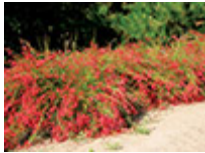
Russelia equisetiformis - coral fountain

Very adaptable plant with tubular, bright coral-red flowers from spring to autumn; show-stopping fountain of flowers attracts hummingbirds; low maintenance and drought tolerant.