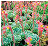
Echeveria 'Imbricata' - hen and chicks

Lovely, drought-tolerant edging plant for partial shade; sculptural foliage rosettes look like blue-green succulent “flowers;” spreads by producing plantlets that slowly form a groundcover.