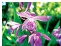
Bletilla striata - Chinese ground orchid

Dense clusters of pink flowers bloom in winter and early spring; classic California garden plant for dry or moist shady border; broad, shiny leaves provide textural contrast to small-leaved plants; attracts beneficial insects. More Details