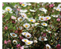
Erigeron karvinskianus - Santa Barbara daisy

California native plant; flowers bloom through the spring, summer, and fall; long-blooming daisy for home gardens; attracts butterflies and beneficial insects. More Details