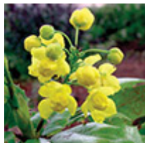
Berberis aquifolium 'Compacta' - compact Oregon grape

This dwarf daisy has deep-violet flowers in late summer; attractive to butterflies and beneficial insects; resists mildew and tolerates wet soils. More Details