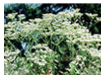
Eriogonum giganteum - Saint Catherine's lace

Good in containers or for trailing over a wall; spreads sparingly by seed in the garden; blooms profusely from spring through fall; attracts butterflies and beneficial insects. More Details