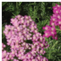
Achillea millefolium 'Island Pink' - island pink yarrow

California native plant; colorful pink flowers in spring, summer, and fall make good cut flowers; ferny green foliage will spread; flowers attract butterflies and beneficial insects.