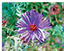
Aster 'Purple Dome' - purple dome Michaelmas daisy

California native plant; known for its smooth, wine-red bark; one of the few manzanitas that tolerates our clay-loam soils; attracts hummingbirds and beneficial insects. More Details