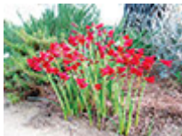
Rhodophiala bifida - red Argentine amaryllis

Showy, easy-to-grow bulb; dark red, trumpet-shaped flowers bloom in late summer; heat and drought tolerant; attracts hummingbirds.