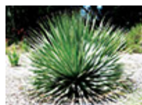
Dasylirion wheeleri - desert spoon

California native plant; thrives in full sun and dry soil; tiny flowers attract pollinating insects; seed pods are curly and fuzzy. More Details