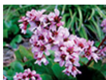
Bergenia crassifolia - pigsqueak

California native plant; dark, grape-like fruits provide food for native birds and can be made into preserves; tough plant that tolerates a variety of garden conditions; attracts beneficial insects and birds. More Details