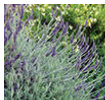
Lavandula x gingsii 'Goodwin Creek Grey' - Goodwin Creek lavender

Provides year-round interest with summer flowers, fall color, and handsome ornamental bark in winter; comes in pink, white, lavender-purple, or red-flowering varieties; hybrid forms are more mildew resistant; attracts beneficial insects. More Details