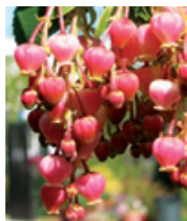
Arbutus 'Marina' - Marina madrone

Shiny evergreen leaves and large drooping clusters of pink flowers are followed by red berries that last into late winter; attractive smooth coppery bark; tolerant of head and alkaline water; very attractive to hummingbirds. More Details