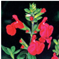
Salvia microphylla - mint bush sage

Leaves have a fruity smell; good for growing under native oaks; thrives with little care in sun or part shade; attracts hummingbirds.