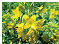
Isomeris arborea - bladderpod

California native plant; most dependable hybrid iris of the Pacific coast; white orchid-like flowers light up shady gardens; grows with little maintenance; narrow leaves form an attractive, evergreen, grass-like mound. More Details