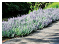
Nepeta x faassenii - hybrid catmint

Striking silvery foliage; very heat and drought tolerant; requires little pruning as a shrub but can be successful as a hedge if sheared; attracts beneficial insects. More Details