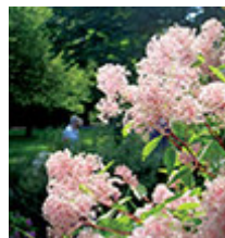
Ceanothus x pallidus 'Marie Simon' - Marie Simon ceanothus

Large, loose clusters of soft-pink flowers complement maroon-red stems; nectar-rich flowers attract bees and other beneficial insects; semi deciduous to evergreen.