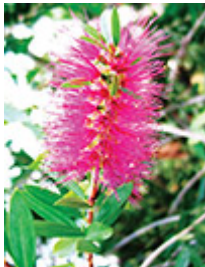
Callistemon 'Violaceus' - purple bottlebrush

Rosy-purple “bottlebrush” flowers bloom in early winter and spring, and sporadically year round; medium to large evergreen shrub that is tough and adaptable; grows best in full sun and tolerates infrequent watering; attracts hummingbirds and beneficial insects.