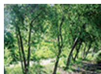
Cercocarpus betuloides var. blanchiae - island mountain mahogany

California native plant; early spring bloom before leaves appear; attractive reddish seed pods in summer; new stems, cut in winter, are used to add color to Native American baskets; attracts beneficial insects. More Details