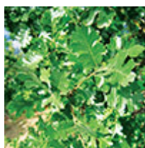
Quercus lobata - valley oak

Penstemon heterophyllus 'Margarita B.O.P.' - Santa Margarita foothill penstemon California native plant; flowers are golden yellow as buds, bright blue as blooms, then change to purple-pink; unlike many California native penstemons, it thrives in garden conditions. More Details