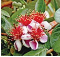
Acca sellowiana (Feijoa sellowiana) - pineapple guava

Attractive spring flowers are edible and sweet; large green berries have a pineapple-like flavor; can be used as hedging or as a screen; attracts hummingbirds.