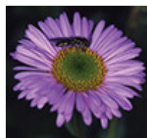
Erigeron 'W.R.' - Wayne Roderick seaside daisy

California native plant; flowers bloom through the spring, summer, and fall; long-blooming daisy for home gardens; attracts butterflies and beneficial insects. More Details