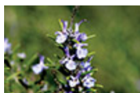
Rosmarinus officinalis 'Mozart' - Ed Carman's rosemary

Evergreen shrub with dark-green leaves that are rich in aromatic oils and prized for cooking; this variety has one of the darkest blue flowers of any rosemary; blooms from spring through summer and often again in fall; attracts beneficial insects. More Details