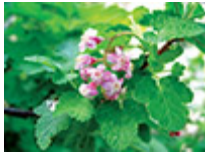
Ribes malvaceum - chaparral currant

California native plant; pale-pink winter flowers attract hummingbirds; drought tolerant with scented leaves.