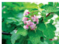
Ribes malvaceum - chaparral currant

California native plant; flowers have a light, spicy fragrance; good choice for planting under native oaks; attracts butterflies and beneficial insects. More Details