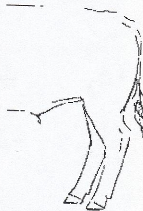
Too much set or "sickle hocks" are usually seen with a droopy rump and cow hocks (hocks turning in).