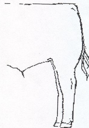
Too little set or "post legs" are often accompanied by a short rump, puffy hocks, and shoulders which are too straight.