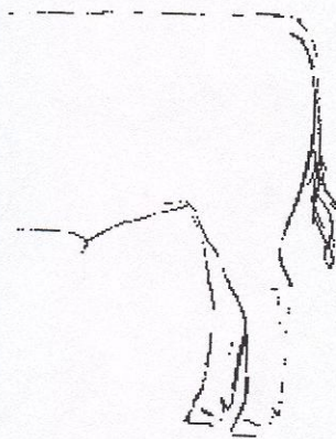
Correct set to the hind leg.