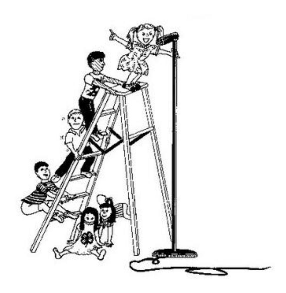
Santa Cruz County March 21, 2015