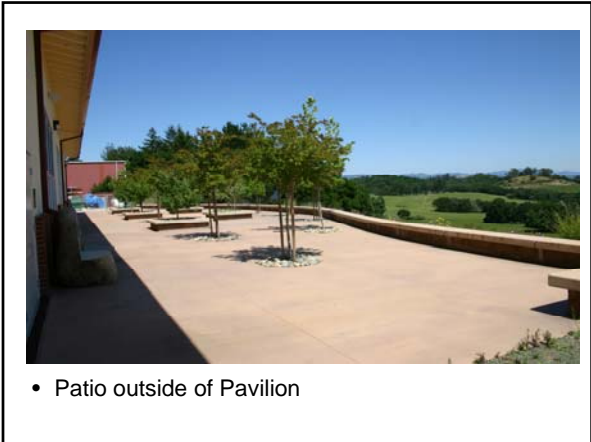
• Patio outside of Pavilion