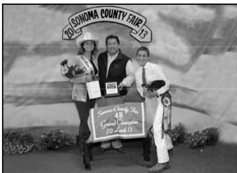
Exhibited and sold by Davey Dorr, Healdsburg 4-H Purchased by G&G Market & Press Democrat for $19.00 per lb. = $2,679.00