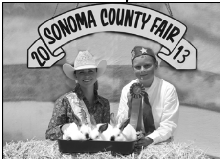
Exhibited and sold by Cole Schafer, Sequoia 4-H Purchased by Northstar Plumbing Sold for $1,000.00