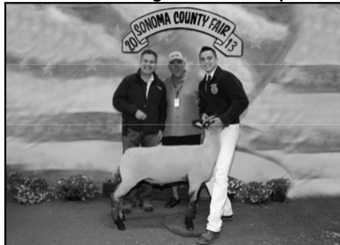
Exhibited and sold by Dominic Leventini, Santa Rosa FFA Purchased by Ovations Catering for $19.00 per lb. = $2,850.00

Lambs weigh between 100-150 lbs. live. Cut and wrap lamb will average yield: 60 lbs. processed meat which will consist of approximately: