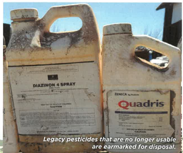
Legacy pesticides that are no longer usable are earmarked for disposal.

If you have pesticides or other unidentified hazardous materials in need of disposal, please contact Kevin Young-Lai at: (707) 678-1655 x 123 or email kevin.young-lai@solanorcd.org .