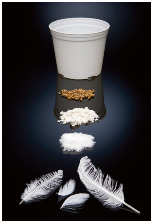
Fig. 13.1 Scientists at the United States Department of Agriculture, Agricultural Research Service developed a process (going from front to back in the photo) by which chicken feathers are shredded, powdered, converted to pellets, and then transformed into biodegradable plastics.

abolished throughout the country. It is likely that this change will open up markets to multiple retailers thereby resulting in greater efficiencies as seen in other parts of the globe.