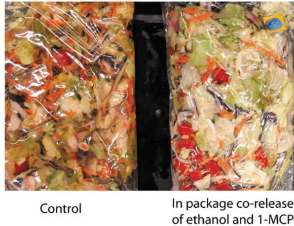
Fig. 13.3 Potential for a co-release technology sachet to control compatibility problems when ethylene producing tomatoes are packaged in salad mixes containing ethylene sensitive vegetables such as lettuce and carrot shreds. Packages of salad mix were obtained directly from a fresh-cut processor and stored at 5 °C for 4 weeks. A full description of the technology is provided by Lu et al. (2008)

consumers with an on package incorporated color patch that will change color as the fruit softens and develops sweetness for eating quality ( http://www.ripesense.com/ ). Technologies providing similar cues to retailers and consumers will help to reduce waste by indicating which fruit are ready for immediate consumption and which require time to ripen. Such technologies would be useful for fruits such as kiwifruit, avocados or melons. Similar technologies could be developed for packaged fresh-cut product indicating remaining shelf life for the product, thus encouraging timely product cycling on the retail shelves and consumption for the consumer.