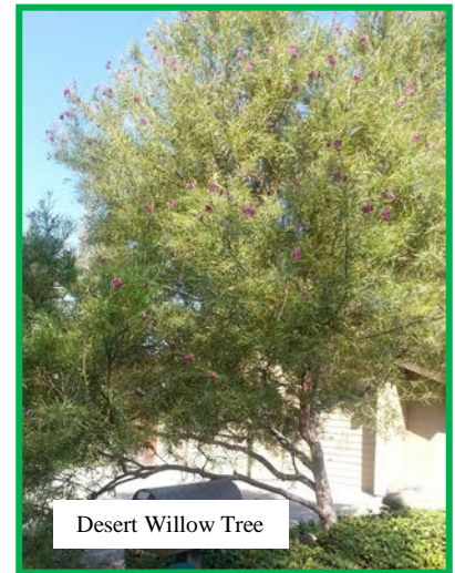
Desert Willow Tree

The Desert Willow was new to me until five years ago when a family of friendly Texans moved in across the street and immediately planted this Texas tree favorite in their front yard. I have since watched it with great interest and much affection. The Desert Willow ( Chilopsis linearis ) is a small, delicate, deciduous tree, native to the desert regions of the Southwest and Mexico. Because of its desert origins, the water requirement is low to moderate, and it loves full sun. This tree has an open growth wispy appearance and is a fast grower. It is called a willow because of its long, narrow 2 to 5 inch long willow-like leaves. While the leaves drop early, heavy seed pods persist through the winter. From spring through fall, the Desert Willow produces lovely purple, pink, lavender, rose or white fragrant trumpet-shaped blossoms with crimped lobes, a hummingbird's delight. The tree is noted for its twisting trunk and rather shaggy bark. Desert Willows need to be thinned occasionally to maintain a rounded, spreading picturesque shape.