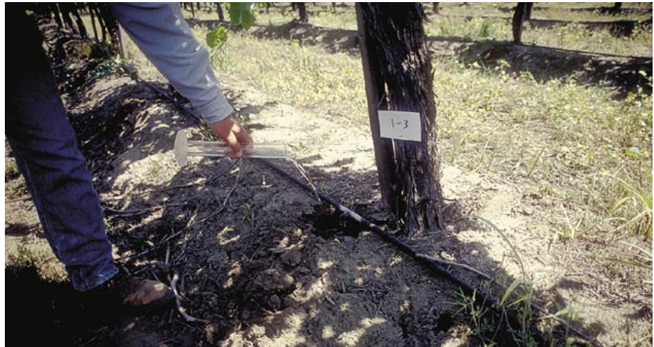
Solubor, a soluble boron product (20.5% boron), was applied to an excavation beneath drippers to simulate fertigation at varying amounts and timing.