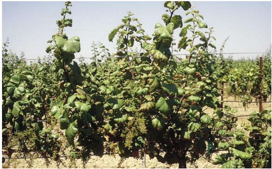
Symptoms of boron toxicity include leaves that are cupped downward with necrotic margins on mature leaves.

The results of this research can be applied to other drip-irrigated vineyards in the San Joaquin Valley under similar conditions: rapidly drained soils, high-quality irrigation water, and low boron content in soil, water and vine tissue. In other regions of the state where winter rainfall is much higher, there would presumably be more leaching of boron fertilizer during winter months and less carryover time after fertilization is discontinued. In contrast, less leaching and greater carryover of boron would be expected in areas of less rainfall or on soils with finer texture and higher water-holding capacity. The amount of boron fertigation used in a maintenance program will vary with leaching potential. These variables underscore the importance of monitoring boron in tissue when developing a long-term fertilization program.