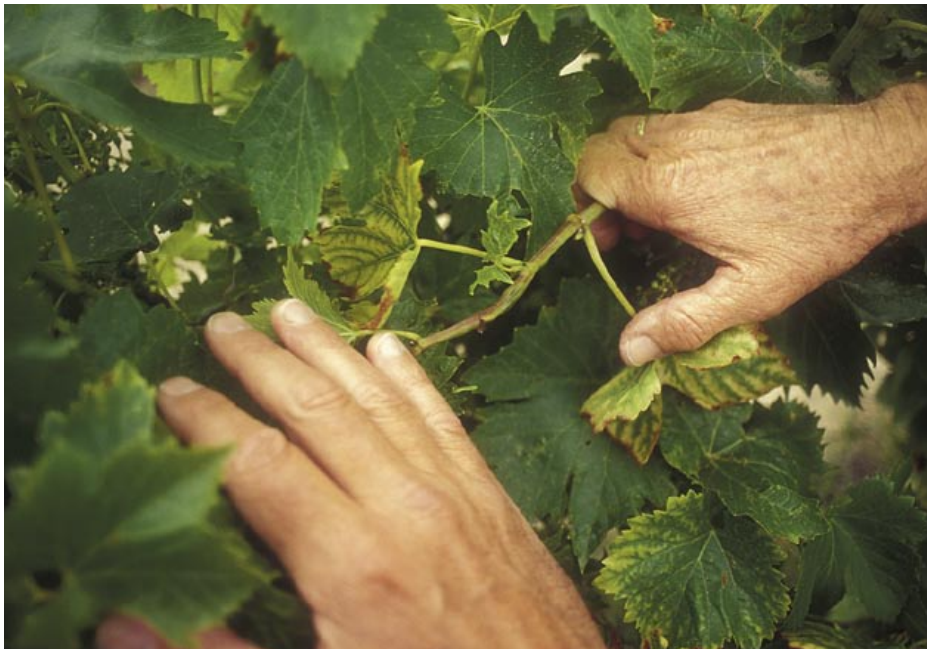
Boron-deficient vines have, facing page, bottom , clusters that set numerous shot berries, small berries with a distinctive pumpkin shape; or, facing page, top , calyptas that stick on young, developing berries. Above , shoots have shortened and swollen internodes, and shoot tips sometimes die.

The goal of boron fertilization of grapevines is to keep tissue levels within a narrow range, since both deficiency and toxicity can have serious negative effects on vine growth and production.