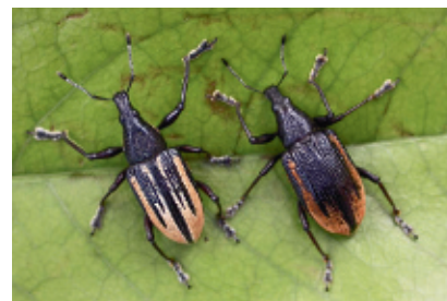
Fig. 1 – Diaprepes Root Weevils

For more information, read Publication 8131: Diaprepes Root Weevil (free) found on the University of California Division of Agriculture and Natural Resources publications website: http://anrcatalog.ucdavis.edu .