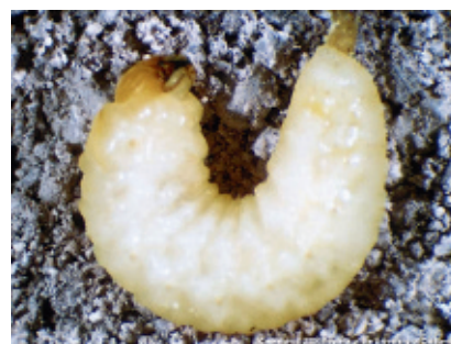
Fig. 4 – Diaprepes larva