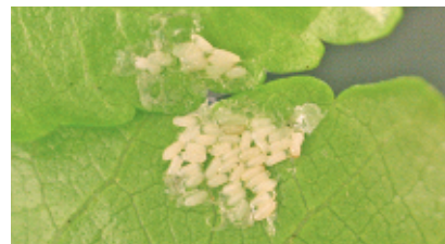
Fig. 3 – Diaprepes eggs about .04 inch long