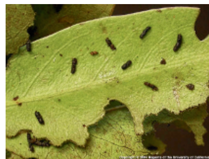
Fig. 2 – Frass left by feeding adults