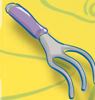
Annie Hall "It Always Looks Good: Choosing the Right Landscape Plants"