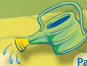
Pat Welsh "Pruning Flowering Shrubs, Climbers and Herbaceous Perennials"