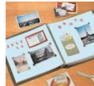
Scrapbooks or pages