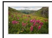
Photographs, paintings or drawings