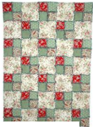
Quilts or sewing