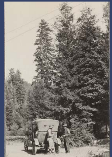
UC faculty in Humboldt evaluating 15 year old redwood sprouts (1921)

UCCE: Supporting your community since 1913; providing research-based solutions for Humboldt's communities, farms and forests